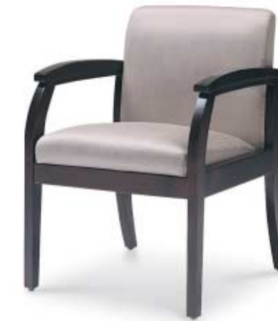
1202C Whitney Guest Seating