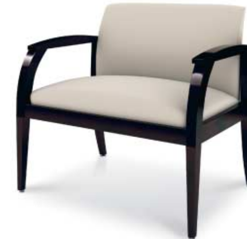
1202-OB Whitney Bariatric Chair Also available: 1202-K