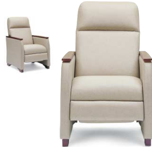
1207WA Whitney Recliner