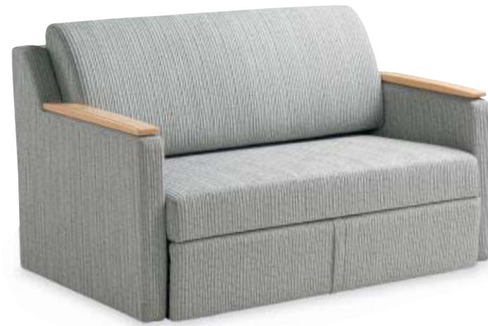
1259-2SC Whitney Sleeper Loveseat Also available: 1259-S Sleeper Chair