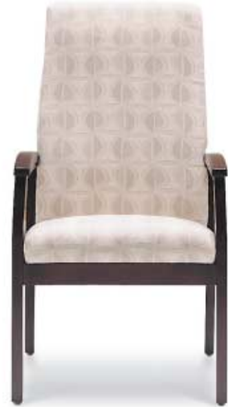
1205 Whitney Patient Seating