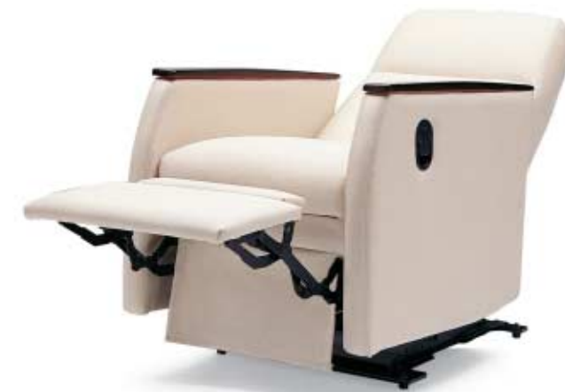
1227 Whitney Wallsaver Recliner