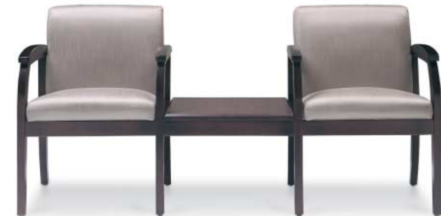
1202CMC Whitney Multiple Seating

The Whitney series offers the following specific features and benefits required by healthcare spaces.