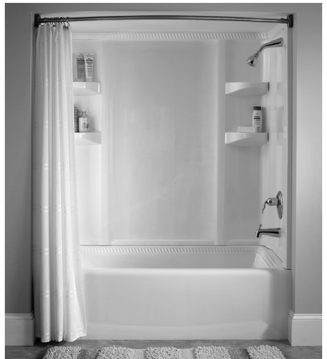
Rope Twist Bath Walls with Rope Twist Bathing Pool Shown. Specify Walls Separately.

For color/finish availability and other faucet choices, please see the Product Selector and Pricing Guide.