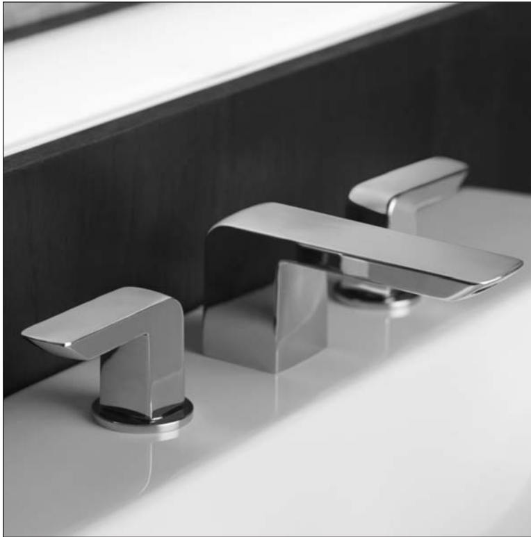
TL960DDC - Soirée™ Widespread Lavatory Faucet