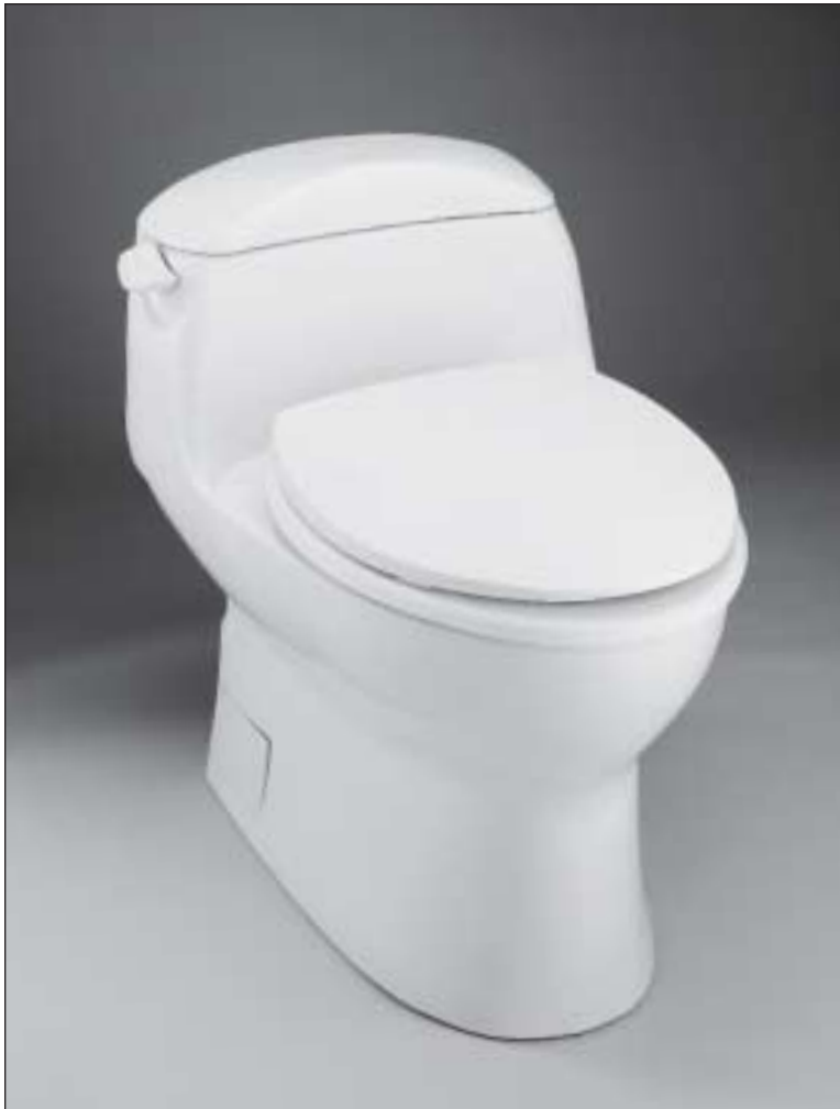
MS914114 - Dorian Toilet with SoftClose Seat