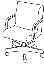
1007 Management Swivel, Wood Arms/Base (shown) 1077 Management Swivel, Black Arms/Base