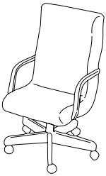
1001 Executive Swivel, Wood Arms/Base (shown) 1071 Executive Swivel, Black Arms/Base

Complement contemporary environments with Scoop seating in black. Lightly textured, urethane arms offer scratch resistance. Nylon-reinforced, five-prong base includes dual-wheel carpet casters.