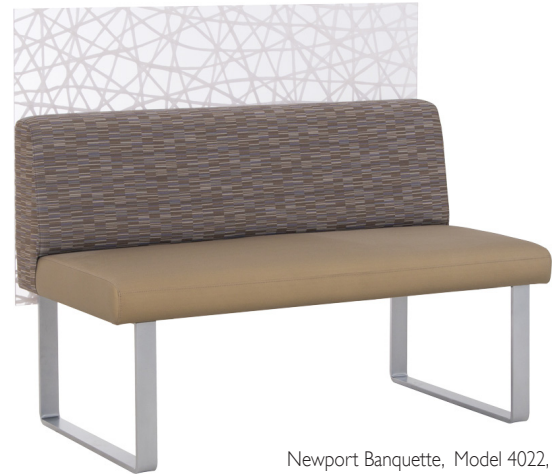
Newport Banquette, Model 4022, with Optional Privacy Panel in 3-Form Material

ERG designs our products so that they can be easily disassembled and separated for recycling or reuse at the end of a products useful life.