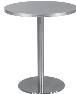
BAR HEIGHT POLISHED CHROME FINISH