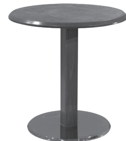
OPTIONAL SQUARE WOOD COLUMN