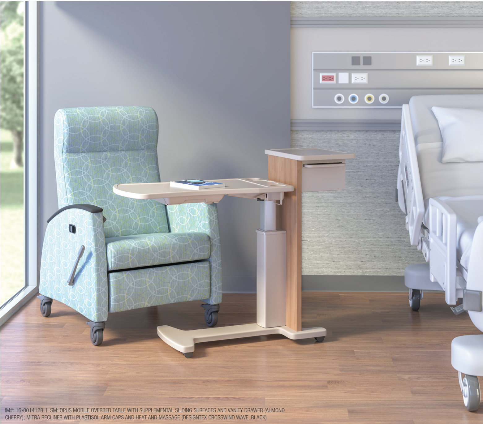
IM#: 16-0014128 | SM: OPUS MOBILE OVERBED TABLE WITH SUPPLEMENTAL SLIDING SURFACES AND VANITY DRAWER (ALMOND CHERRY); MITRA RECLINER WITH PLASTISOL ARM CAPS AND HEAT AND MASSAGE (DESIGNTEX CROSSWIND WAVE, BLACK)