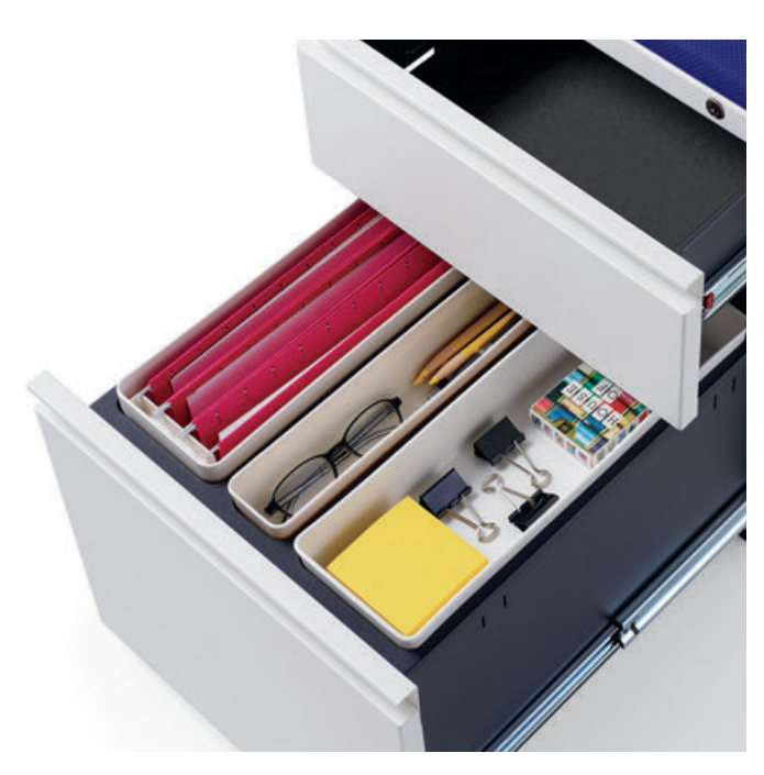
A variety of inserts are available to organize the items in a drawer.

Tu Storage gives people what they need and nothing more. By avoiding excess, Tu brings focus to storage as a place for workplace essentials, extending its capacity beyond the handling of papers and files. Its efficient design results in a footprint that maximizes the use of floor space at an affordable price.