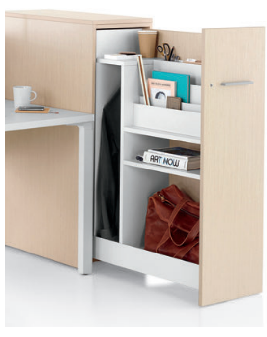
Tu easily accommodates a variety of personal and work items, from jackets to notebooks, all in a single unit.

Tu Storage is an essential element for creating settings that support people's work activities. It lets individuals easily store and access their belongings, both work tools and personal items, whether they have assigned workpoints or they use unassigned desks on a drop-in basis.