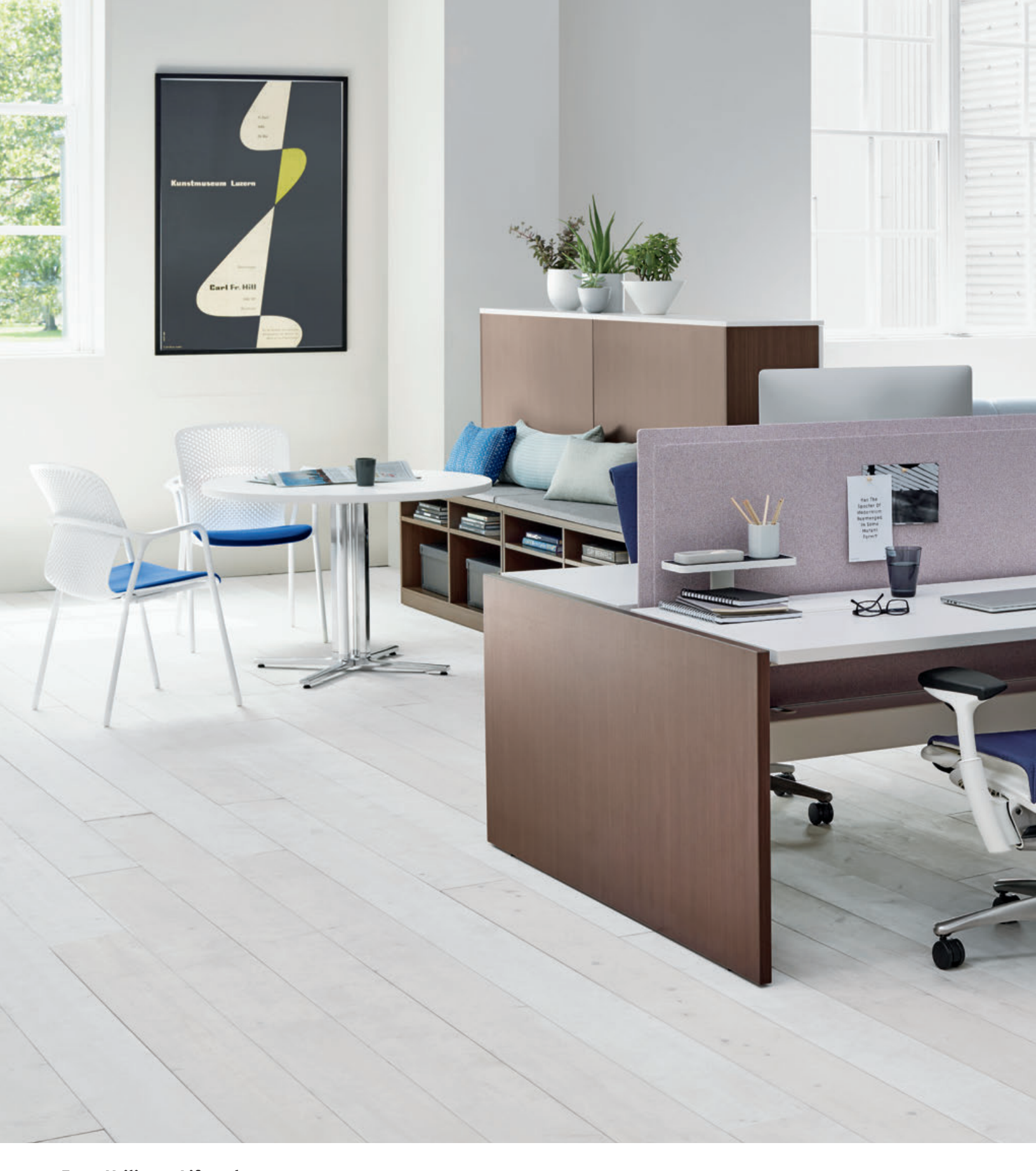
From Utility to Lifestyle