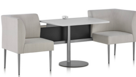
Two Seat Booth