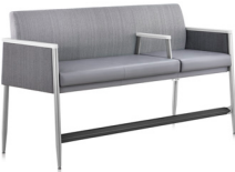
Easy Access Plus Chair with Intervening Arm

Solid surface arm cap (shown) provides long-term durability and design versatility.