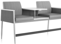
Easy Access Two Seat Chair with Inner Table