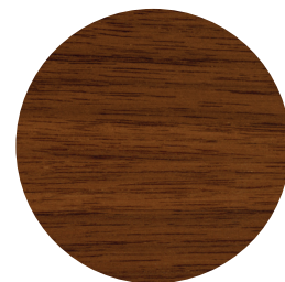
Old English Walnut