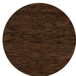
Peacock Green Walnut