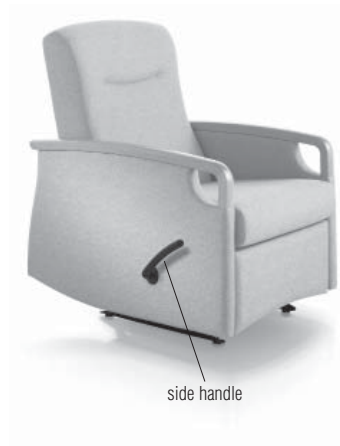
Figure 2 - Wallsaver Recliner