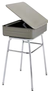
Series 30 lift lid