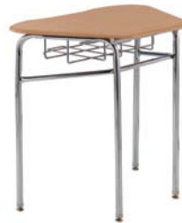
Series 60 w/book basket