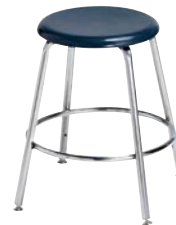
Series ST 18"