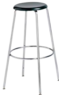
Series ST 30"