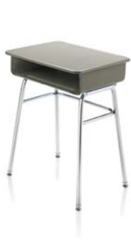
Series 20 open front