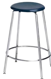
Series ST 24"