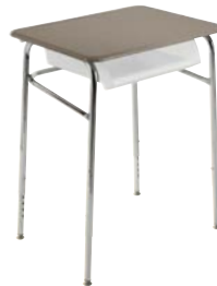
Series 40 w/book box