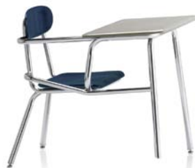
Series 61 belly room - 14"