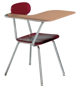
Series 90 belly room - 14"