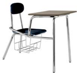
Series 56 w/book basket belly room - 15"