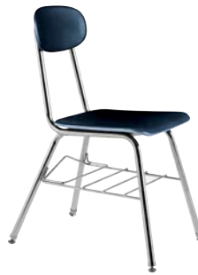
Series 10 w/ Book Rack