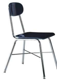
Series 10 X-Brace