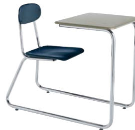
Series 58 belly room - 16"