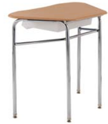
Series 60 w/book box