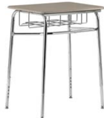
Series 40 w/book basket