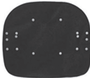
Seat Cover #7USCKI64