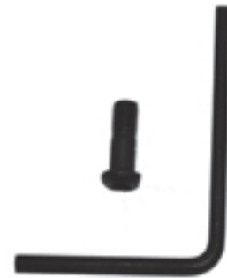
Back to Upright Screw & Wrench #7SCRM8X25

1 1/4" tapped & threaded M8 x 25mm holes