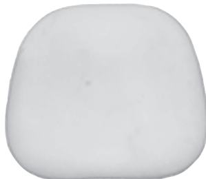
Seat Foam #FMSZA