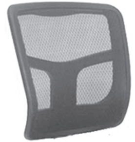
Seat Back #IPBACKYS70U