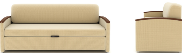
SLEEPER CHAIR PULL-OUT