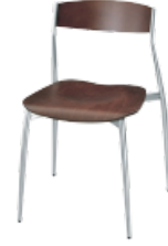
Baba 1.2 (Large)