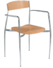
Baba 2.2 (Large)