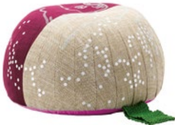
Bovist, Motif "Lacemaker"

Bovist is a decorative floor pillow, stool and ottoman all in one. Its appealing shape and casual comfort are provided by the tapered radial seams around the sides and a compact filling of synthetic beads. Large embroidered patterns add striking accents to the textile cover, which is sewn together out of contrasting