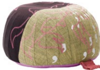
Bovist, Motif "Dove"

Bovist is a decorative floor pillow, stool and ottoman all in one. Its appealing shape and casual comfort are provided by the tapered radial seams around the sides and a compact filling of synthetic beads. Large embroidered patterns add striking accents to the textile cover, which is sewn together out of contrasting