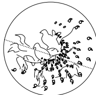
Bovist, Motif "Dove",