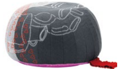
Bovist, Motif "Pottery"

fabrics. With its knitted handle, Bovist can be easily moved from one room to another.