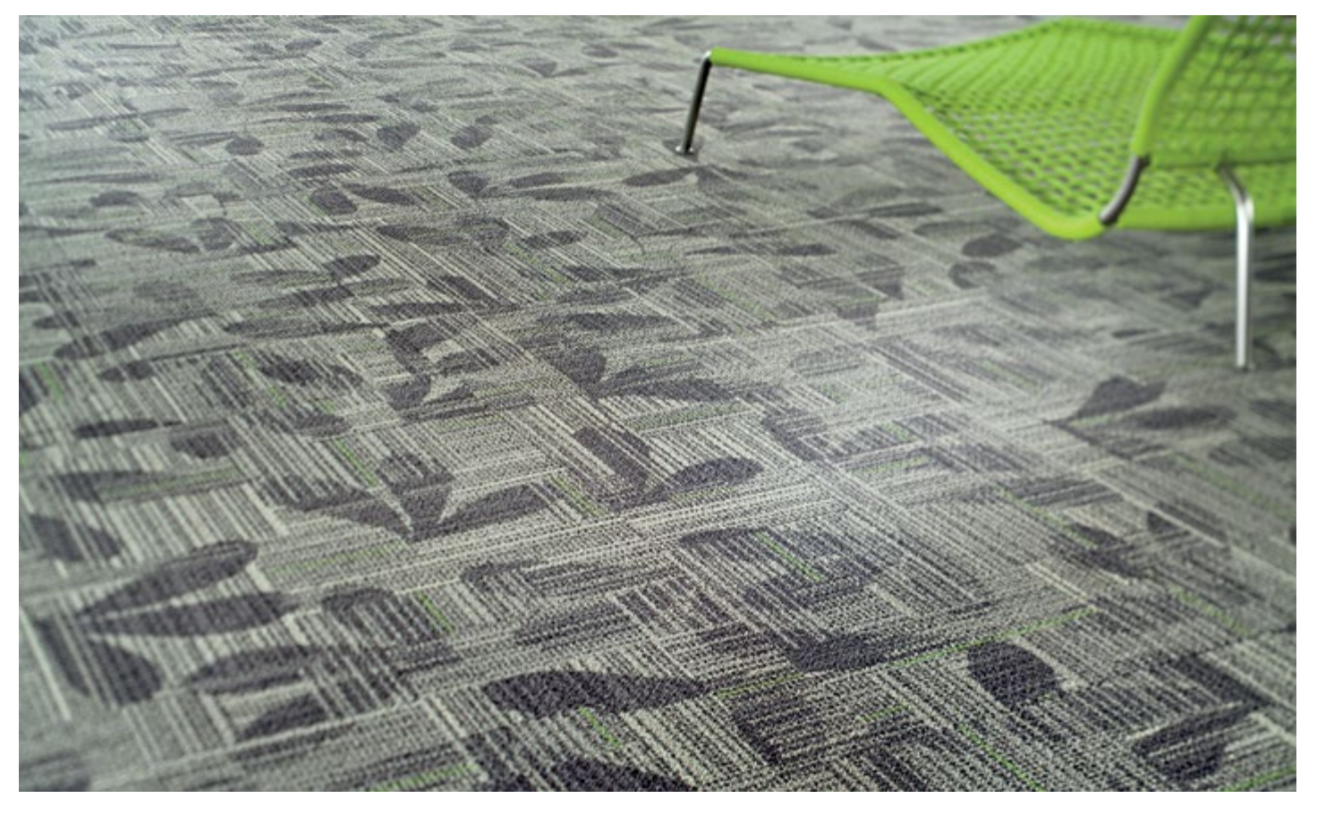
Bebop in Slam with Apple, monolithic installation