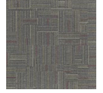
FREESTYLE FRS137-131 RUMBLE WITH BOYSENBERRY