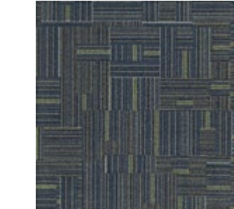
FREESTYLE FRS141-52 ROLLOFF WITH APPLE