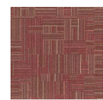
FREESTYLE FRS135-109 ETCHED WITH TANGERINE