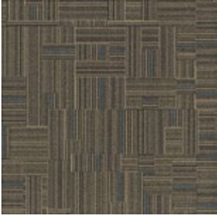
FREESTYLE FRS126-93 HUM WITH FRENCH BLUE