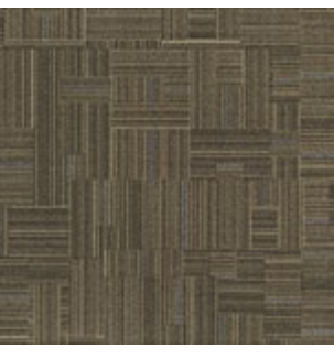
FREESTYLE FRS138-89 HIGH HAT WITH PERIWINKLE