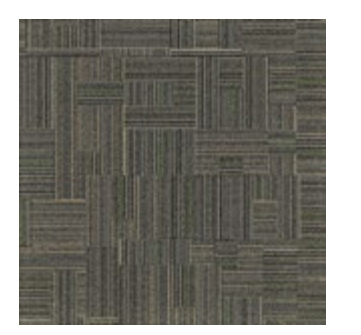
FREESTYLE FRS141-108 BONUS TRACK WITH APPLE