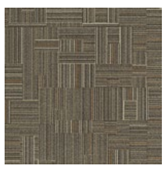
FREESTYLE FRS134-42 REVERB WITH STAR FRUIT