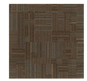
FREESTYLE FRS98 PITCH WITH NO VIBE