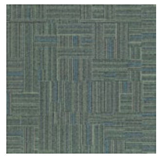
FREESTYLE FRS43 HOWL WITH NO VIBE