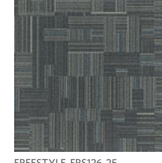
FREESTYLE FRS126-25 HEADROOM WITH FRENCH BLUE