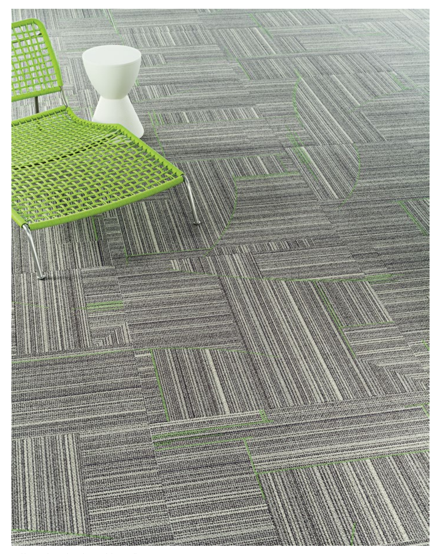
Backbeat in Slam with Apple, monolithic installation