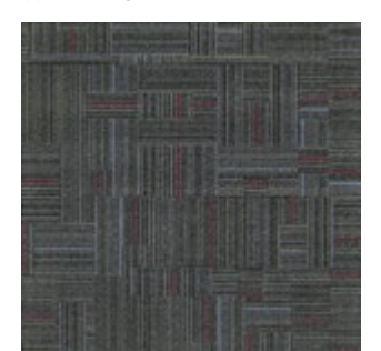
FREESTYLE FRS109-130 DJ WITH SCARLET