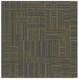
FREESTYLE FRS141-132 LAIDBACK WITH APPLE