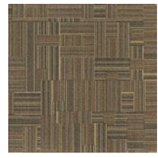
FREESTYLE FRS135-90 TIMBRE WITH TANGERINE