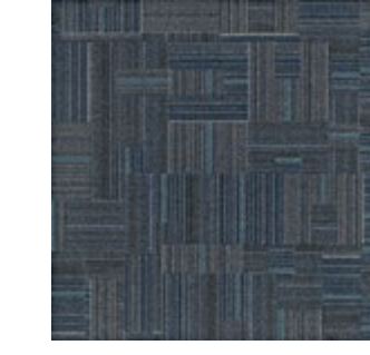
FREESTYLE FRS140-107 OVERDUB WITH AZUL