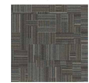
FREESTYLE FRS126-120 CUE UP WITH FRENCH BLUE