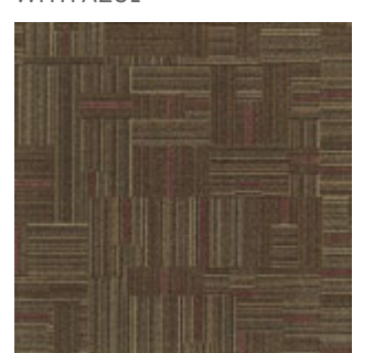
FREESTYLE FRS109-77 A SIDE WITH SCARLET