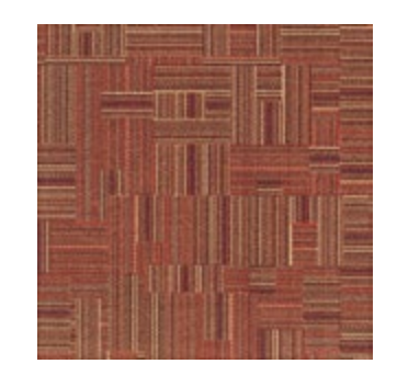
FREESTYLE FRS137-129 UPBEAT WITH BOYSENBERRY