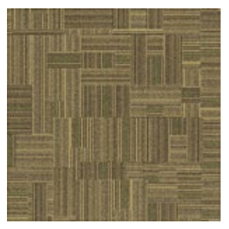
FREESTYLE FRS141-75 TURNTABLE WITH APPLE