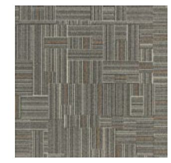
FREESTYLE FRS134-83 SLAM WITH STAR FRUIT