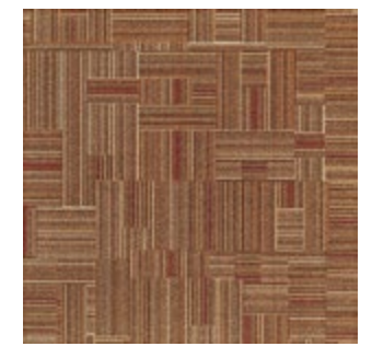
FREESTYLE FRS109-128 TAUT WITH SCARLET