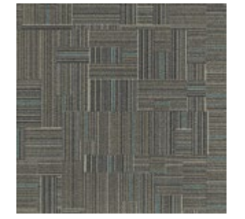
FREESTYLE FRS140-67 SNARE WITH AZUL