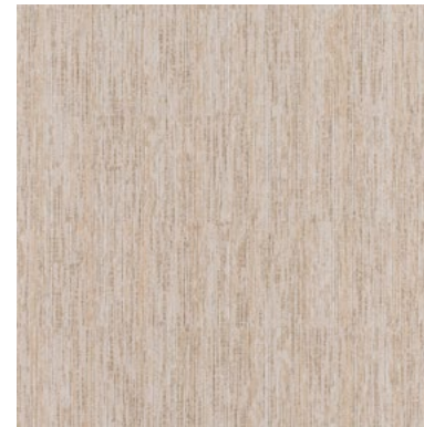
NAL21-39-4 Balsa (Fin FIN21-39-4, Tapa TAP39-4)