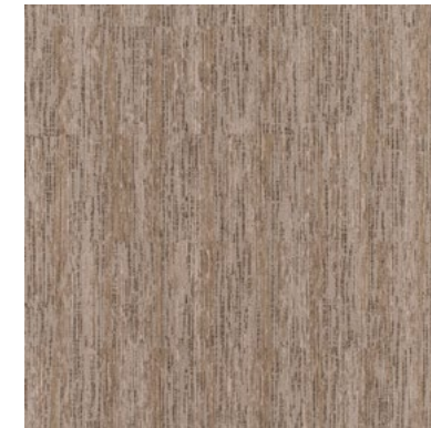
NAL4-114-122 Rincon (Fin FIN4-114-122, Tapa TAP114-122)