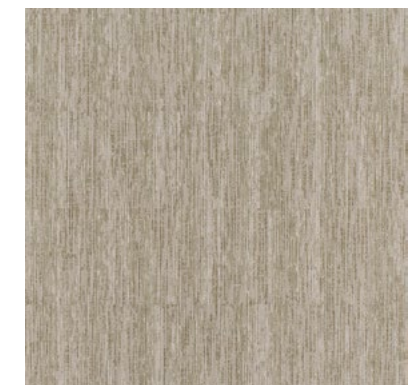
NAL37-45-48 Hanalei Bay (Fin FIN37-45-48, Tapa TAP45-48)