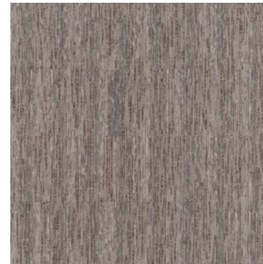
NAL144-96-165 Waimea (Fin FIN144-96-165, Tapa TAP96-165)