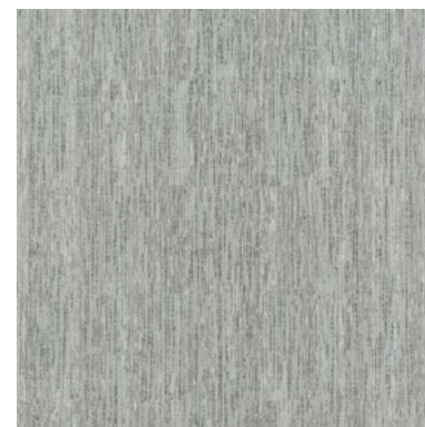
NAL139-67-132 Green Room (Fin FIN139-67-132, Tapa TAP67-132)