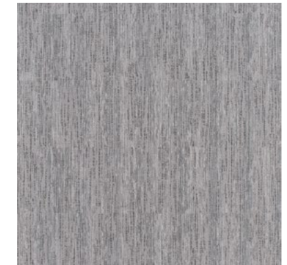
NAL13-180 Cloud Break (Fin FIN13-180, Tapa TAP13-180)