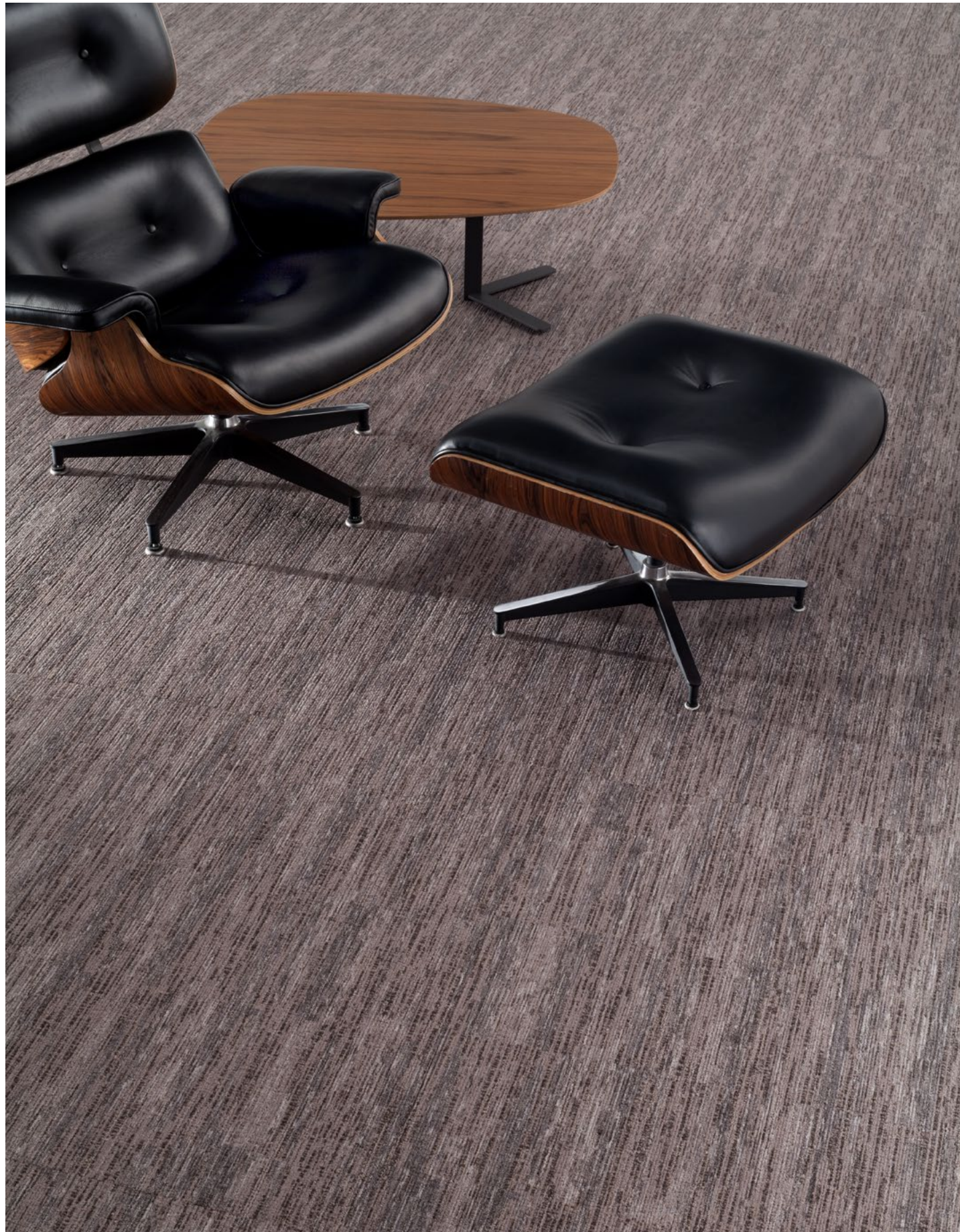
Nalu in Waimea, monolithic tile installation