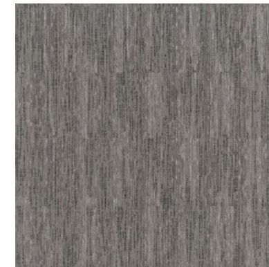
NAL144-67-97 Laird (Fin FIN144-67-97, Tapa TAP67-97)