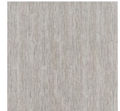
NAL173-144 Steamer Lane (Fin FIN173-144, Tapa TAP173-144)