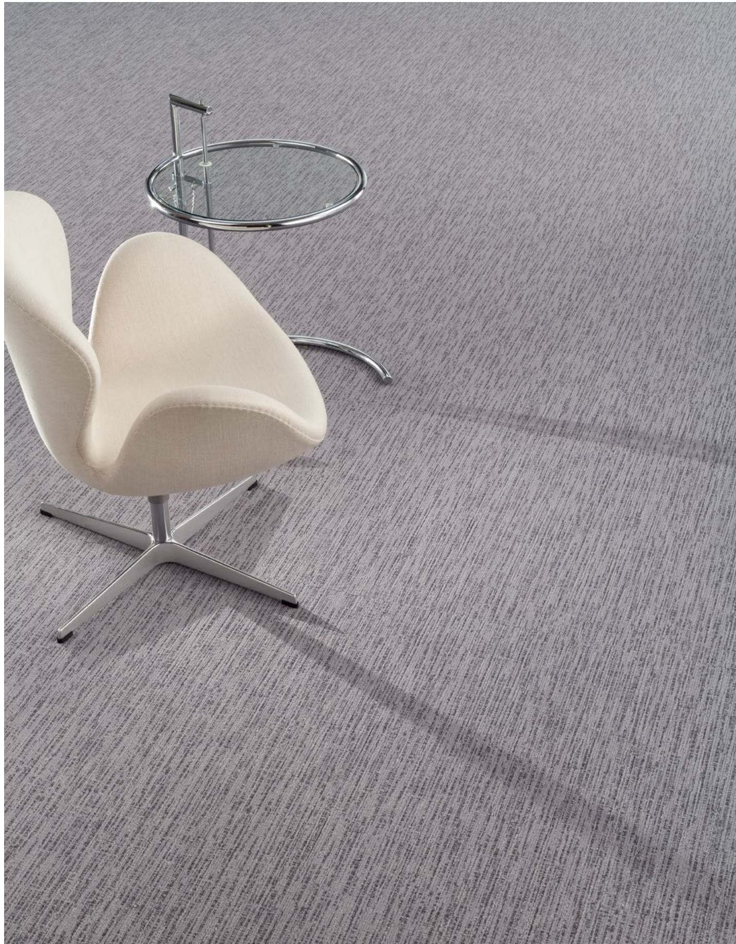
Tapa in Cloud Break, monolithic tile installation