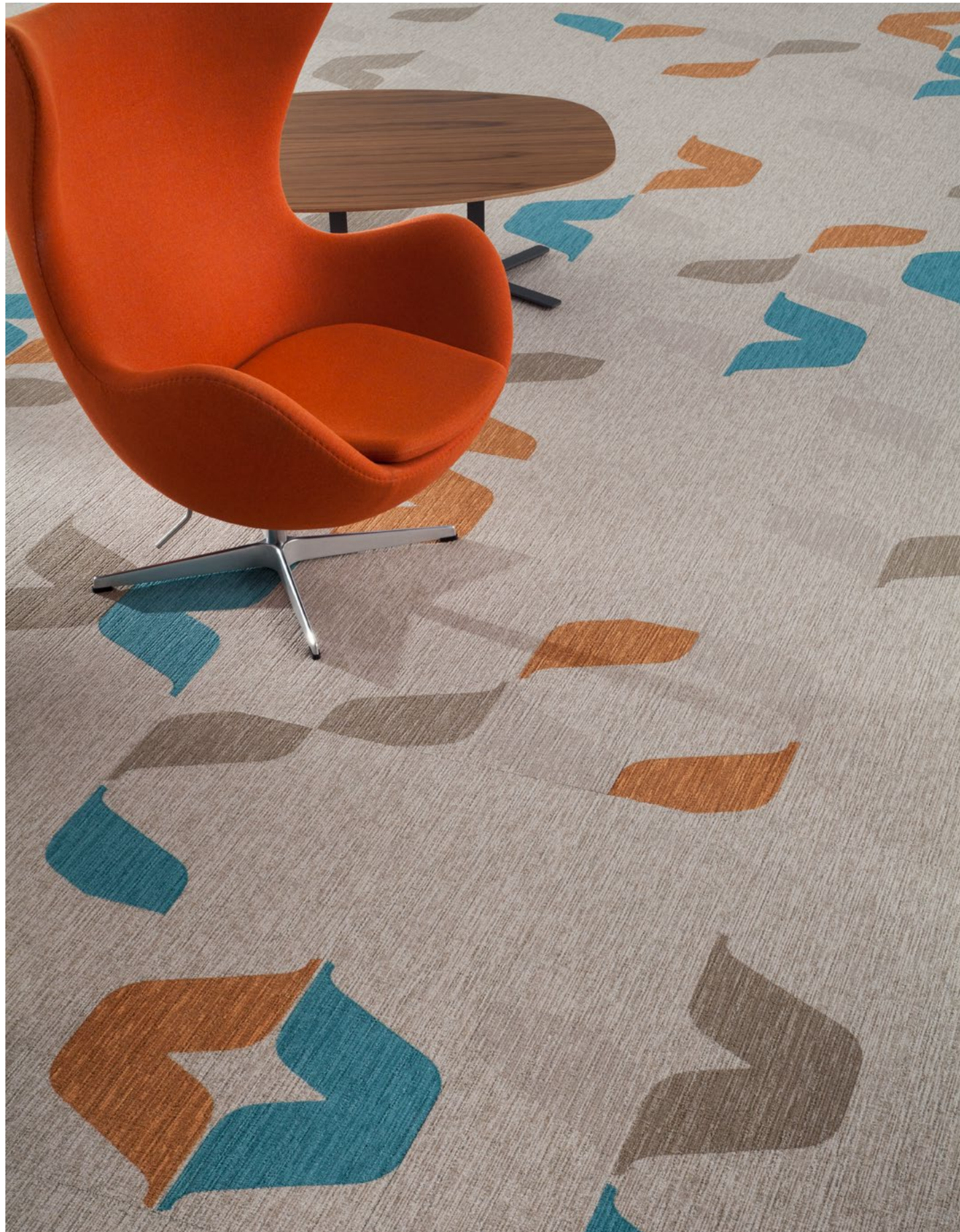
Fin in Custom Color, monolithic tile installation Contact your Milliken representative for custom order guidelines.