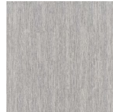
NAL139-5-171 Nosara (Fin FIN139-5-171, Tapa TAP5-171)