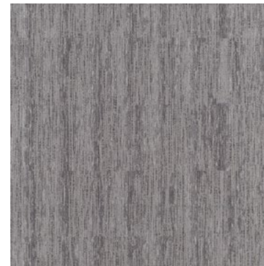
NAL180-118-5 Pipe Line (Fin FIN180-118-5, Tapa TAP118-5)