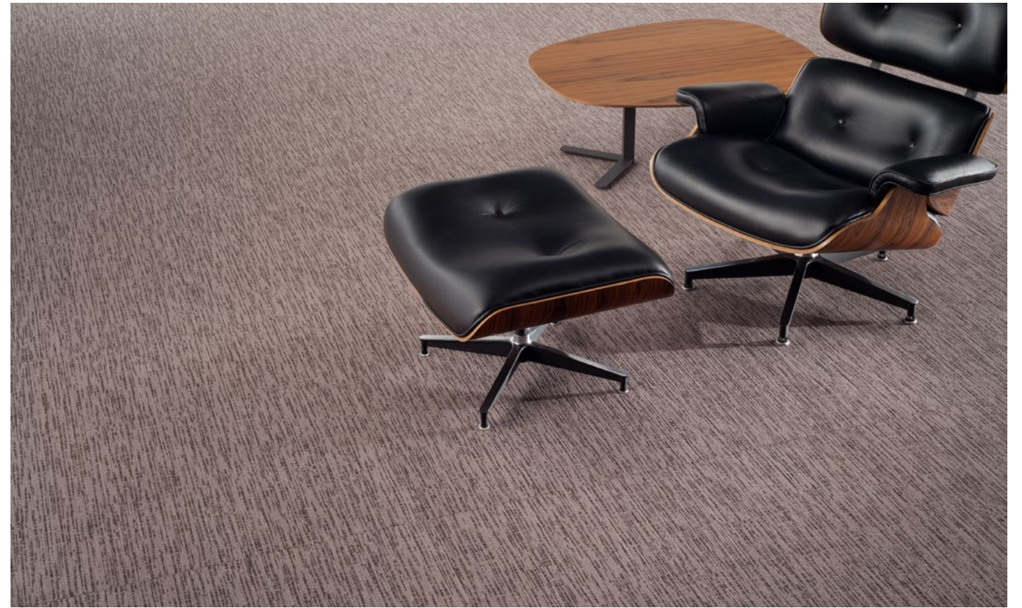
Tapa in Waimea, monolithic tile installation