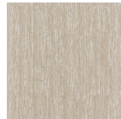
NAL21-81-4 Slater (Fin FIN21-81-4, Tapa TAP81-4)