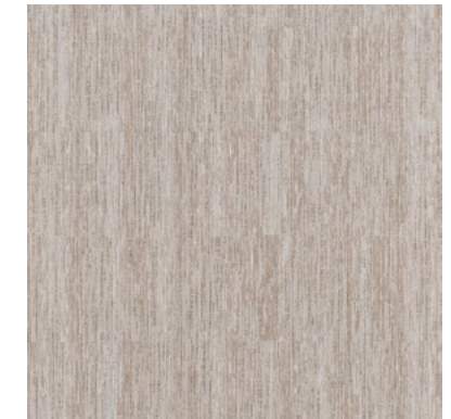
NAL15-93-144 Kandui (Fin FIN15-93-144, Tapa TAP93-144)