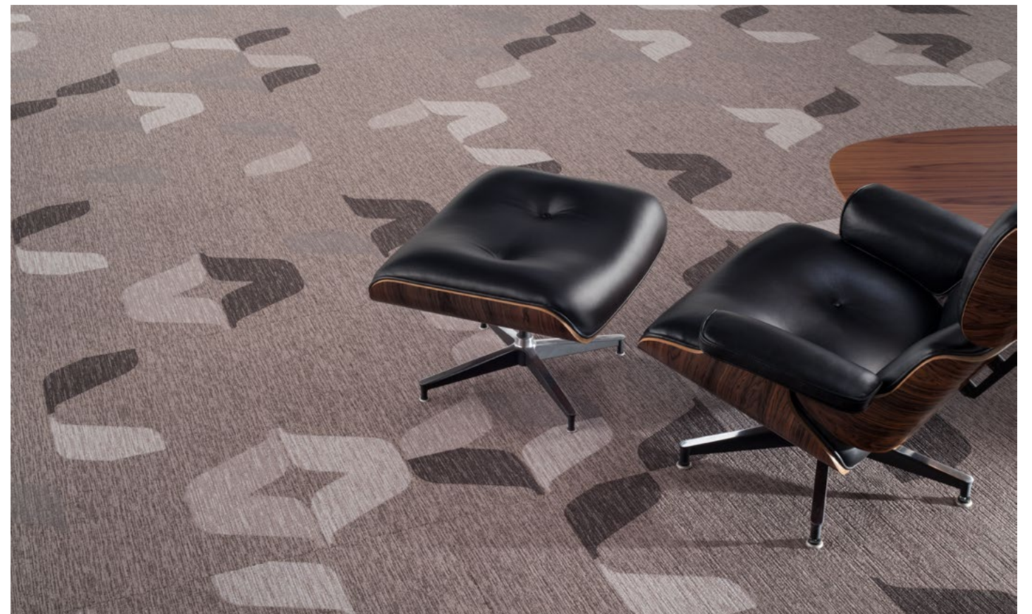
Fin in Waimea, monolithic tile installation