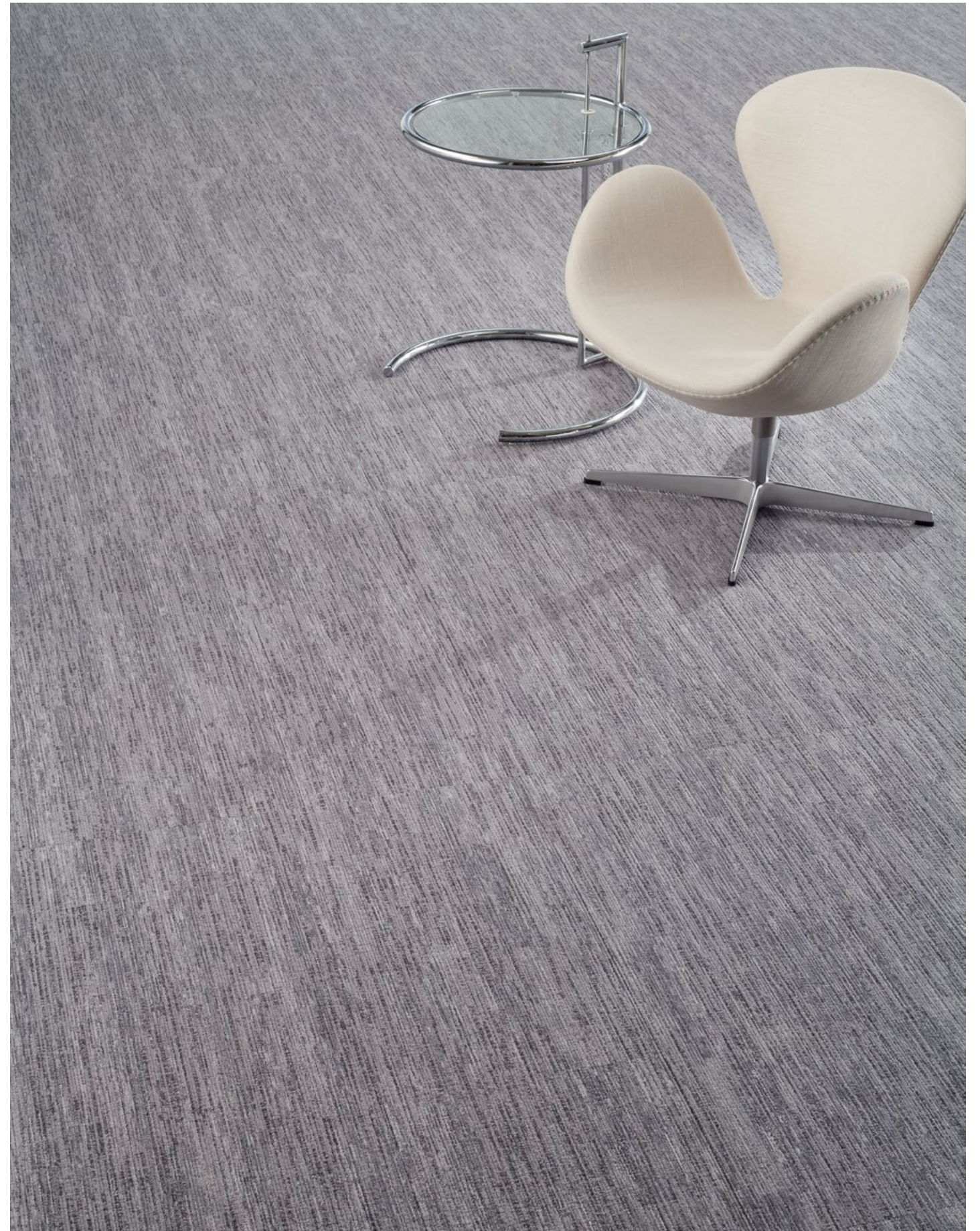
Nalu in Cloud Break, monolithic tile installation