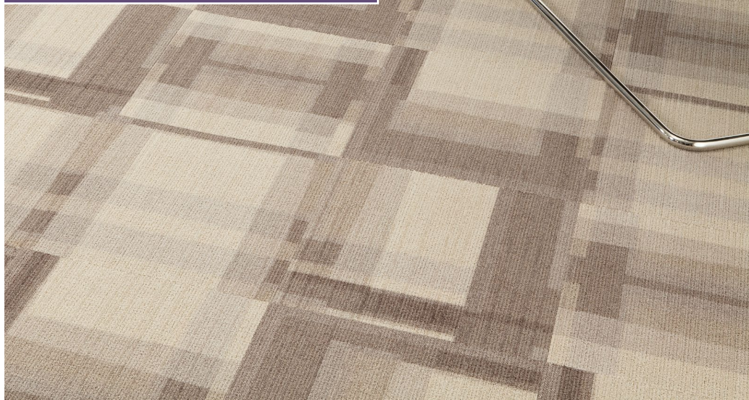
Windows in Nimbus, monolithic installation