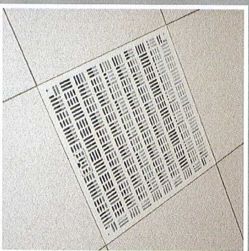
Powder Epoxy Coating