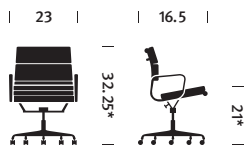
*Adjustable height, +/- 1.5" Manual with Casters