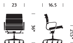
*Adjustable height, +/- 2" Pneumatic with Casters