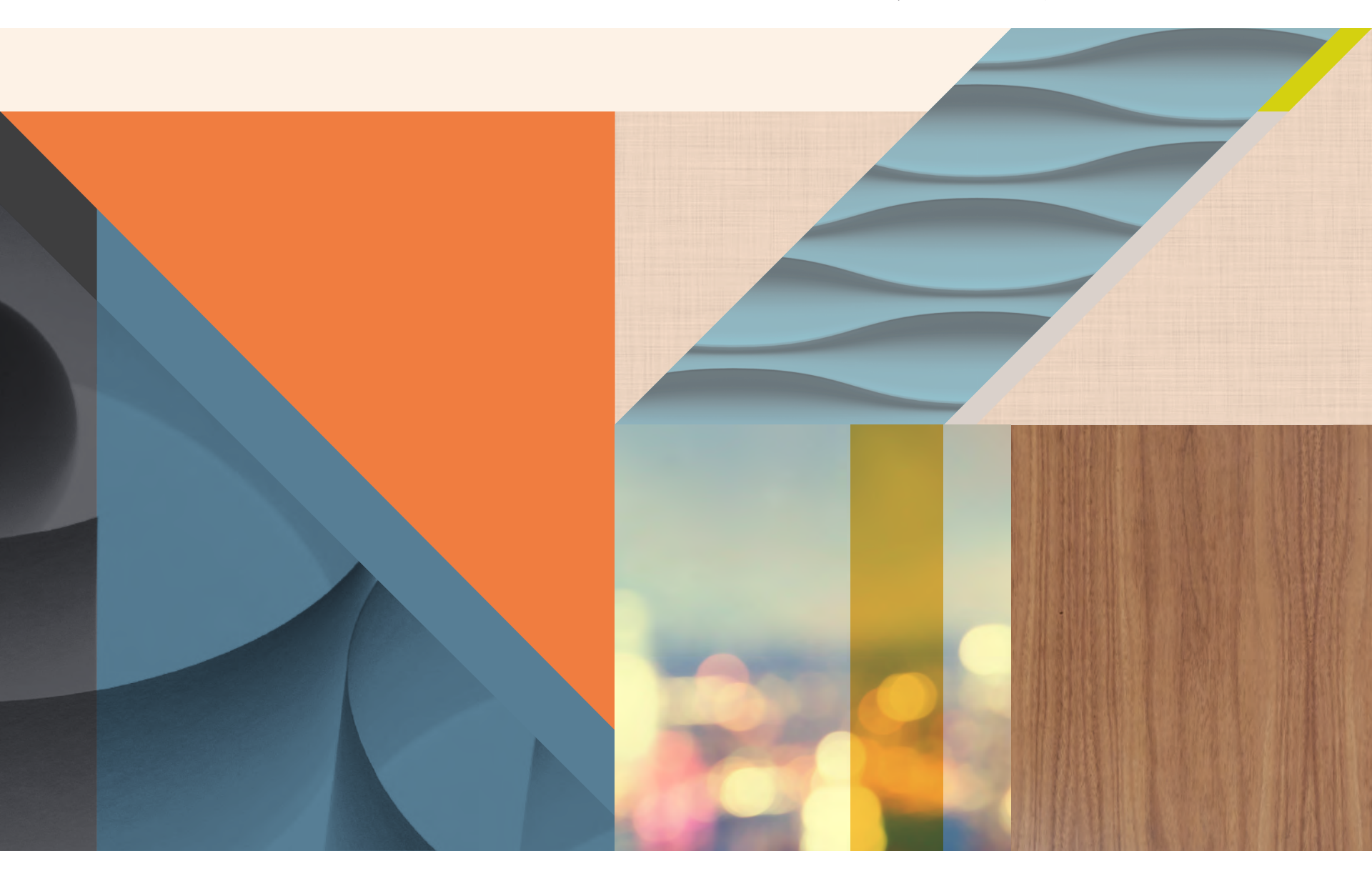
Layers of Organic Workspace®