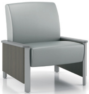
Available without arms to allow for easy patient transfer.

Engineered for strength and designed for comfort, Dignity2 is ideal for hard-use applications. Designed with patient safety in mind, the front steel legs are contoured to eliminate sharp edges. All arm caps are field-replaceable.