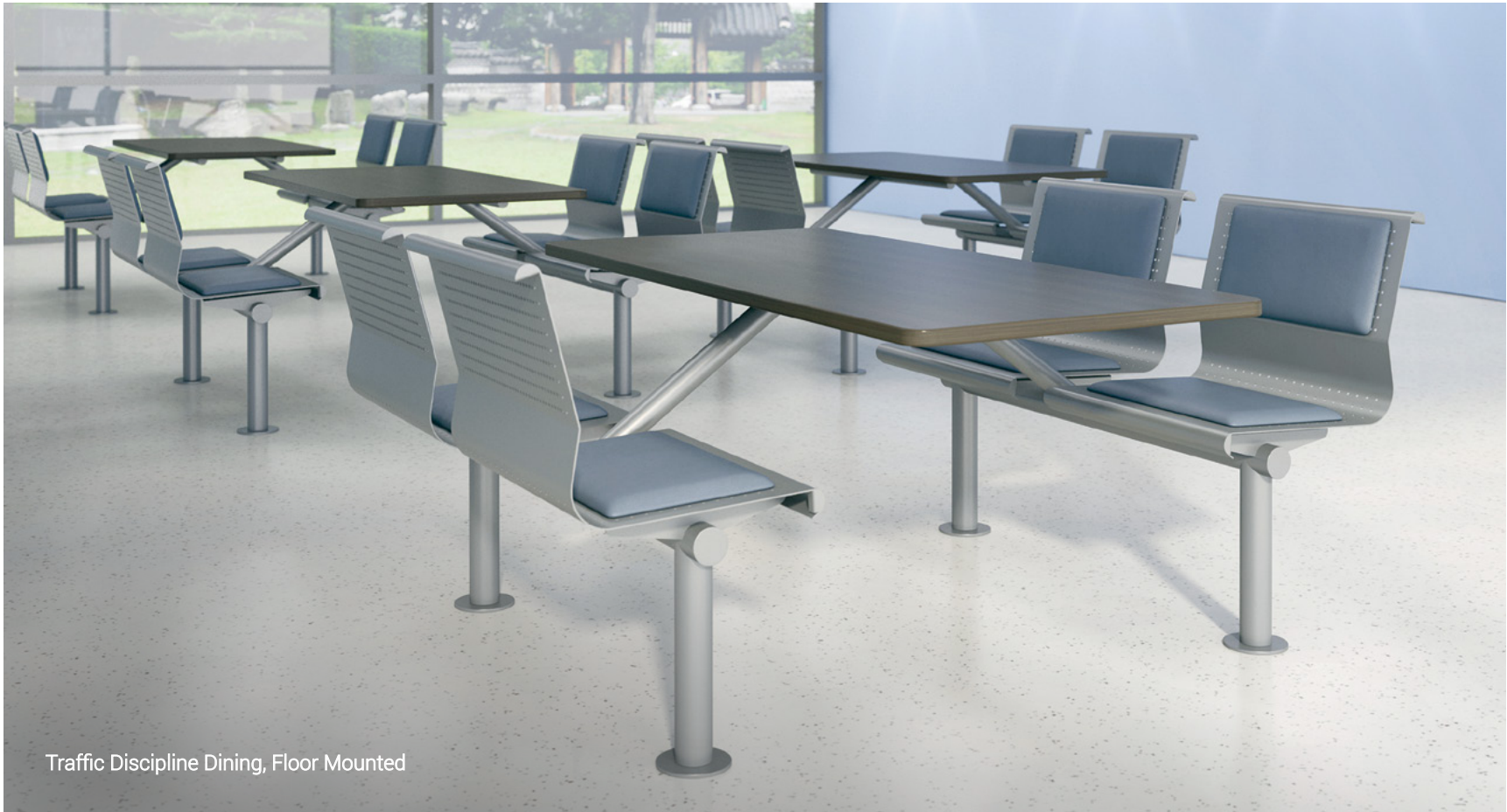
Traffic Discipline Dining, Floor Mounted

PRODUCT FINISHES Top: Wilsonart 7949K-38 Upholstery: Momentum Silica, Regatta Metal Finish: RAL 7045