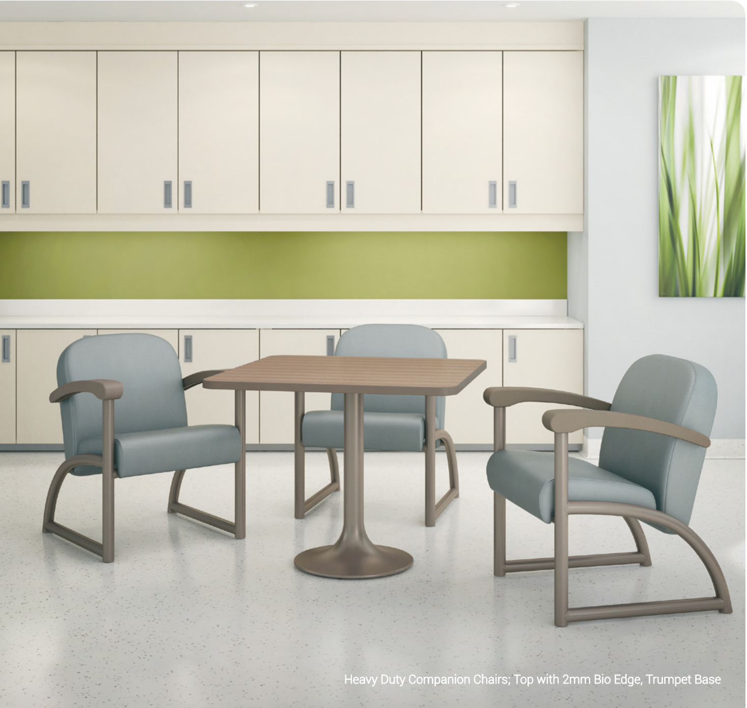
Heavy Duty Companion Chairs; Top with 2mm Bio Edge, Trumpet Base

PRODUCT FINISHES (left) Top: Wilsonart D354-60 1000 Series Upholstery: Momentum Beeline, Eucalyptus Midway Seat Upholstery: Momentum Beeline, Eucalyptus Midway Back Upholstery: Momentum April, Mist Metal Finish: Deep Taupe (right) Top: Arborite W-433 RM Upholstery: Momentum Silica Tech, Mineralize Metal Finish: Deep Taupe