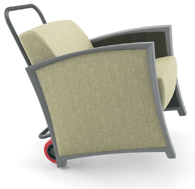
Dolly available to move single seat Dignity1 and Dignity2 with ease.

Both Dignity1 and Dignity2 offer Bariatric, one, two and three seat designs. Complete your design by choosing from a wide range of options and features to create a solution as unique as its space.