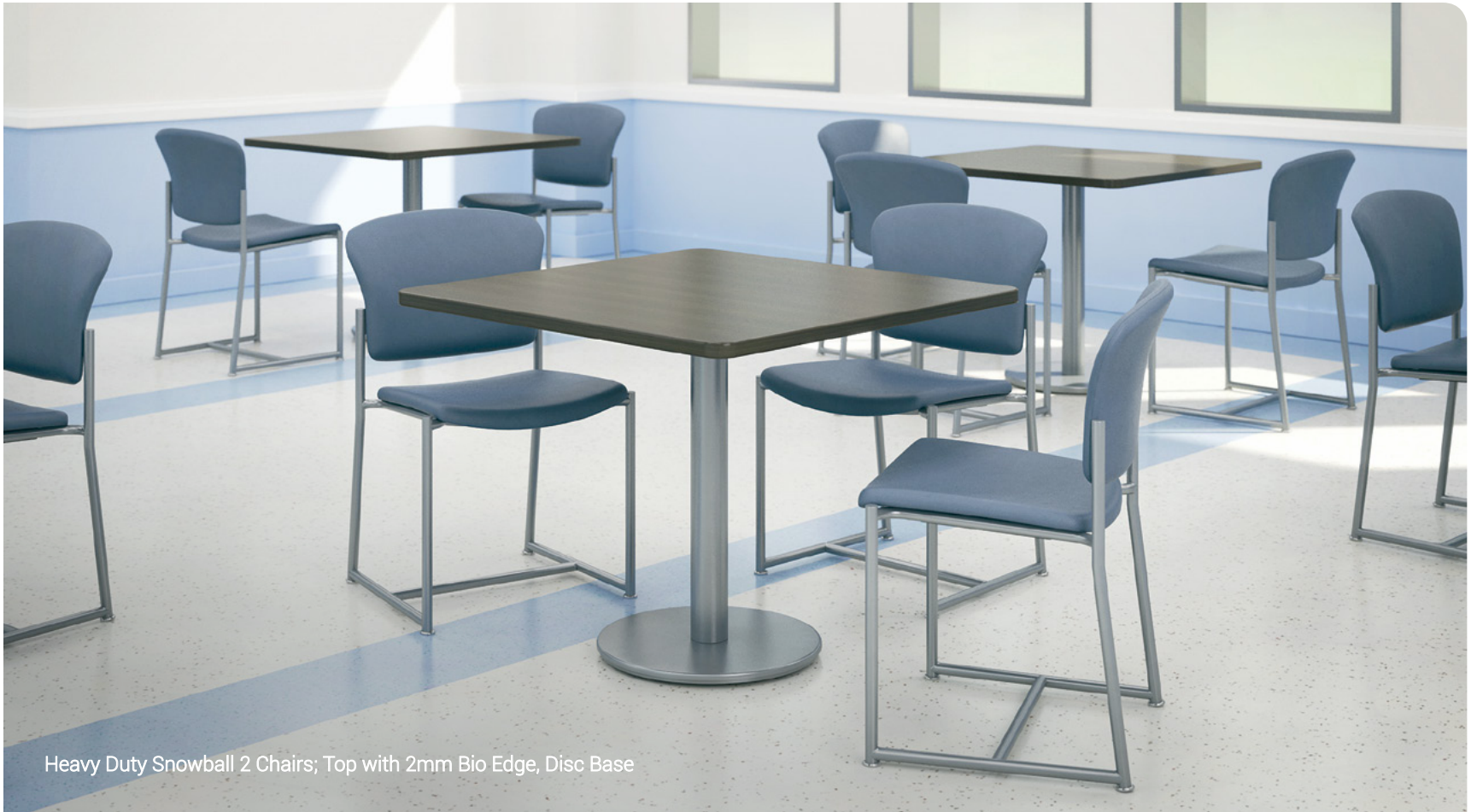
Heavy Duty Snowball 2 Chairs; Top with 2mm Bio Edge, Disc Base