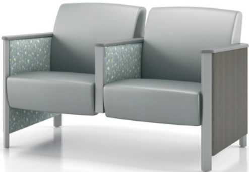
Two and three seat designs are available with or without half-panel arms between seats.