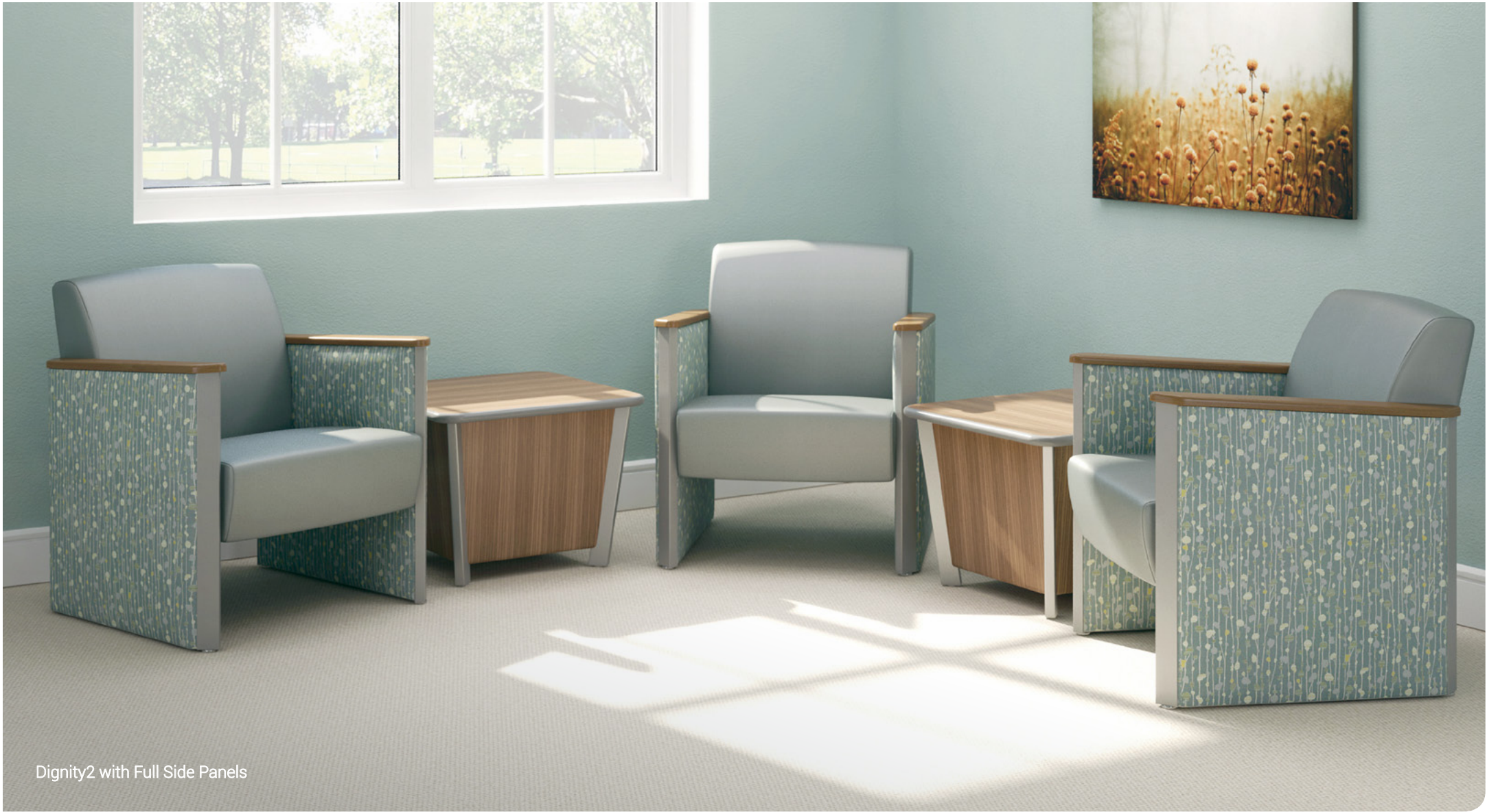
Dignity2 with Full Side Panels

Seat & Back Upholstery: Momentum Silica Tech, Mineralize. Side Panels: Momentum April, Mist. Tables: Arborite W-433RM.