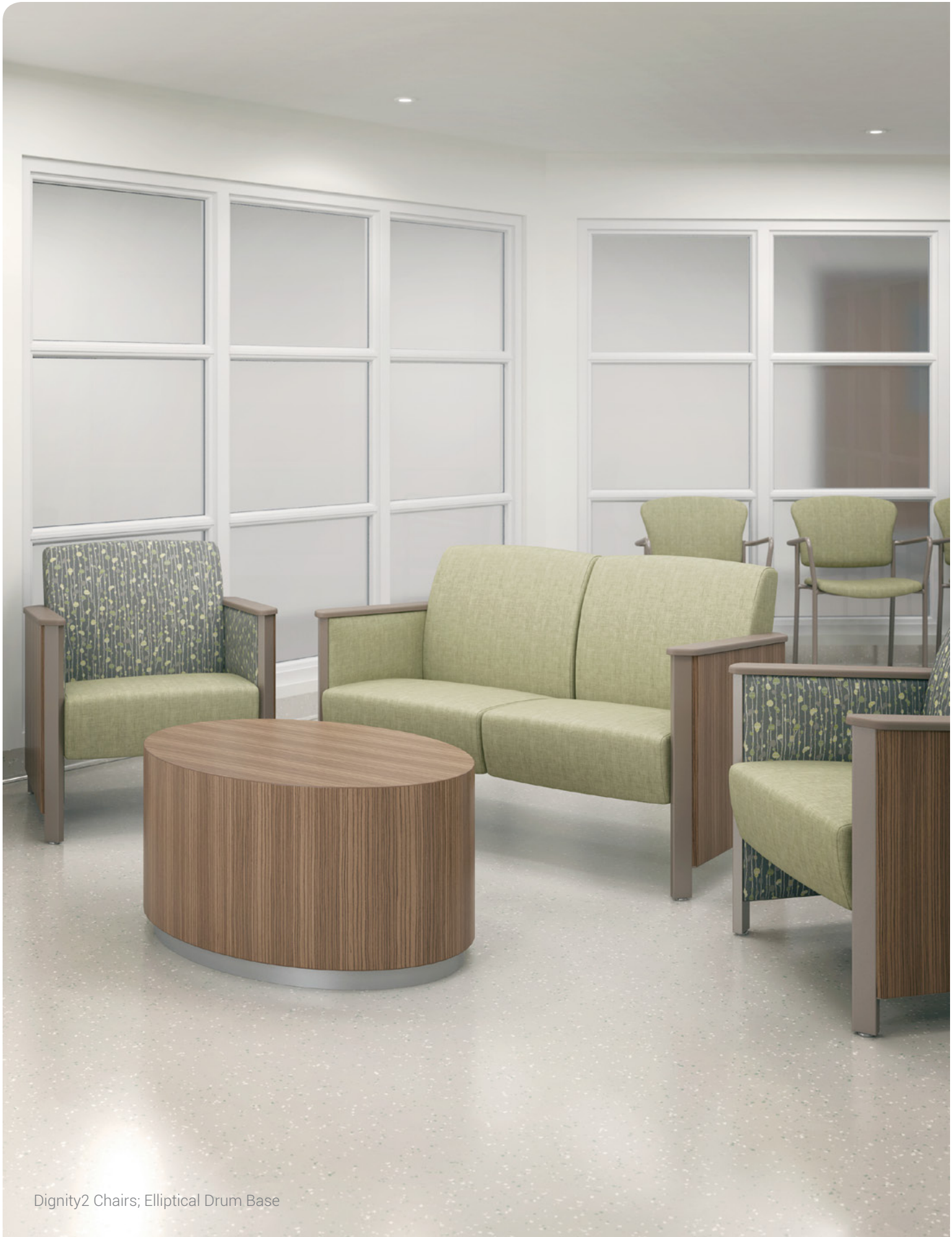
Dignity2 Chairs; Elliptical Drum Base