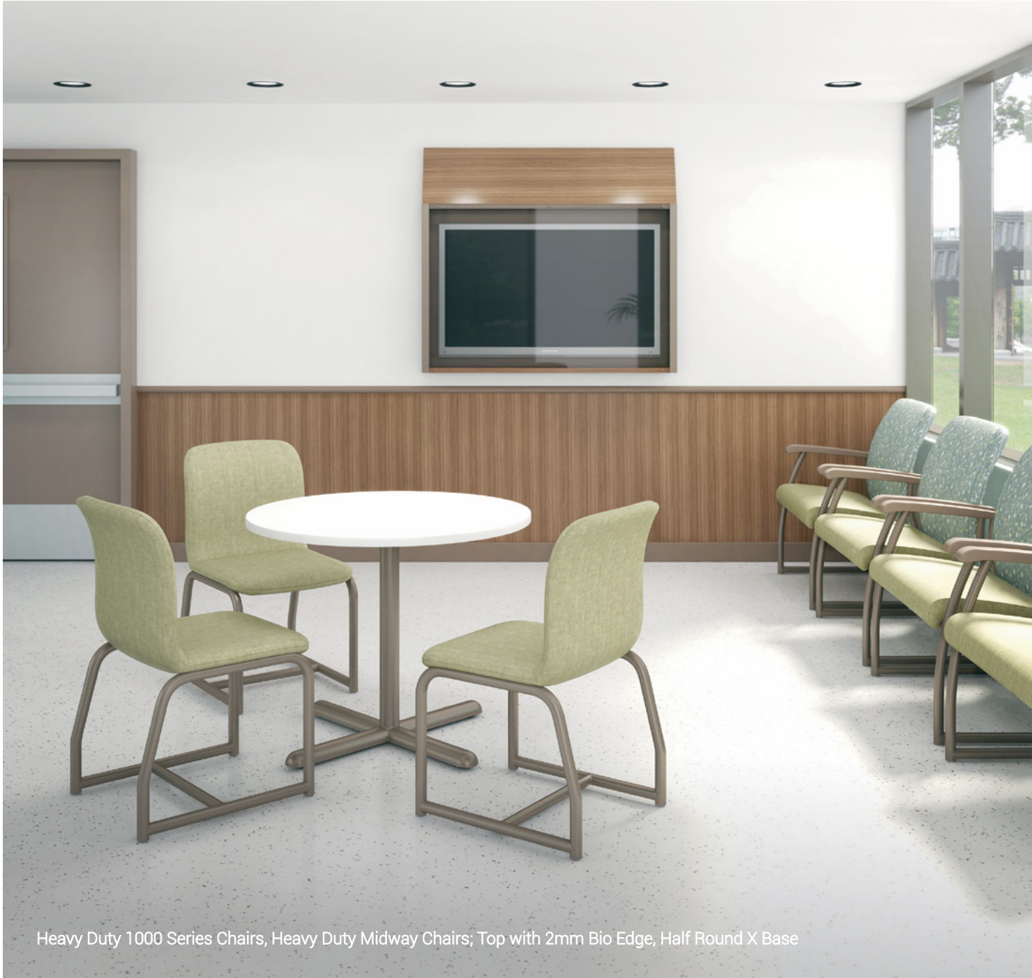
Heavy Duty 1000 Series Chairs, Heavy Duty Midway Chairs; Top with 2mm Bio Edge, Half Round X Base

From tables and seating to television enclosures and more, Spec's extensive product offering makes it easy to furnish this challenging environment. Consult our experienced team to address your specific requirements or applications.