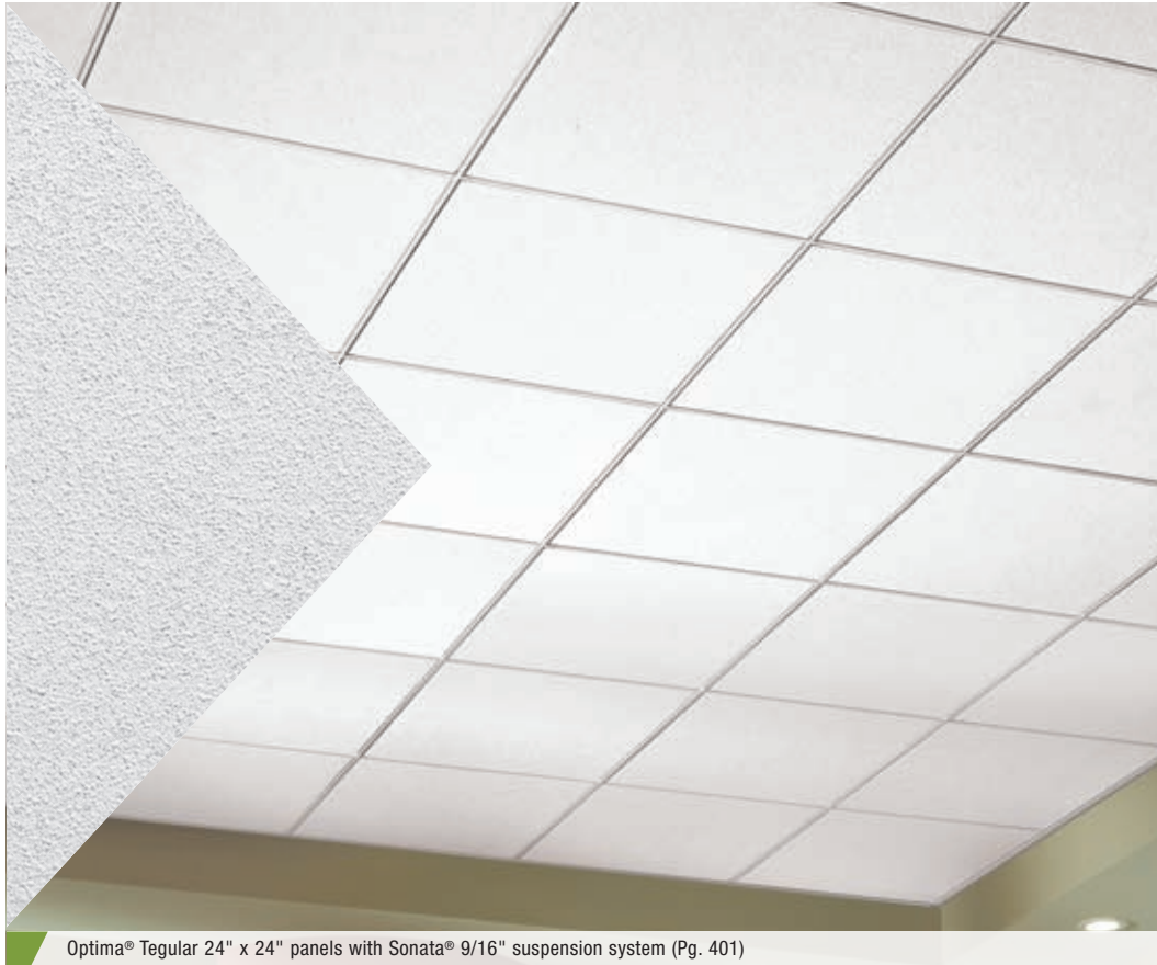
Optima® Tegular 24" x 24" panels with Sonata® 9/16" suspension system (Pg. 401)