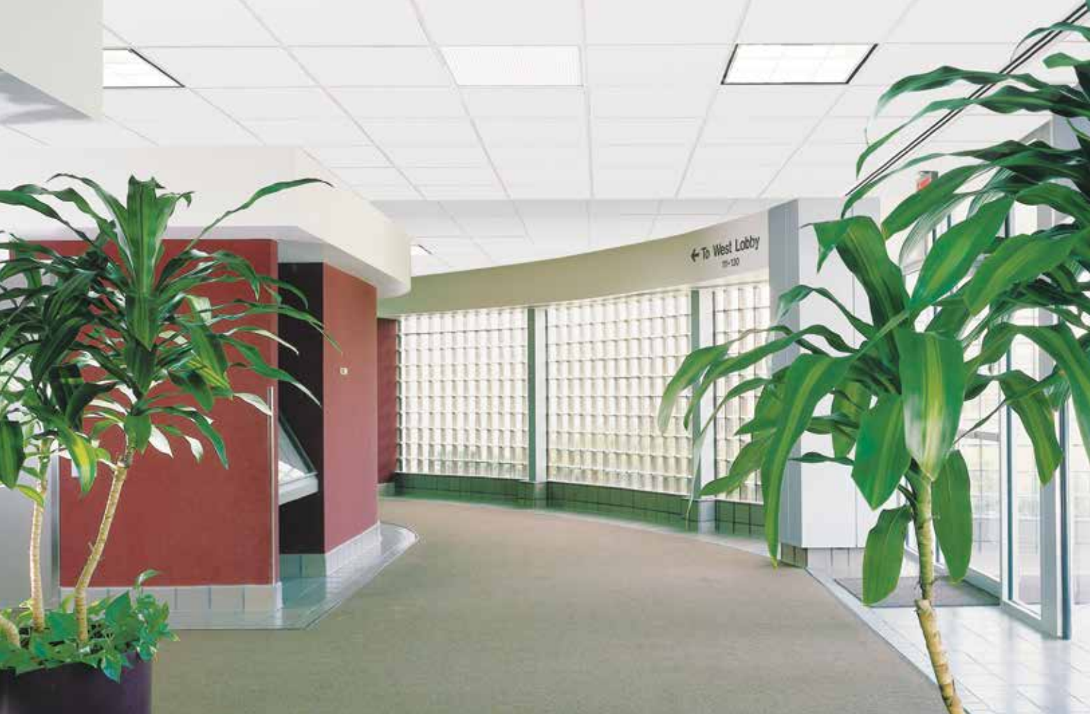
Sand Micro™ Reveal (SHM-154)