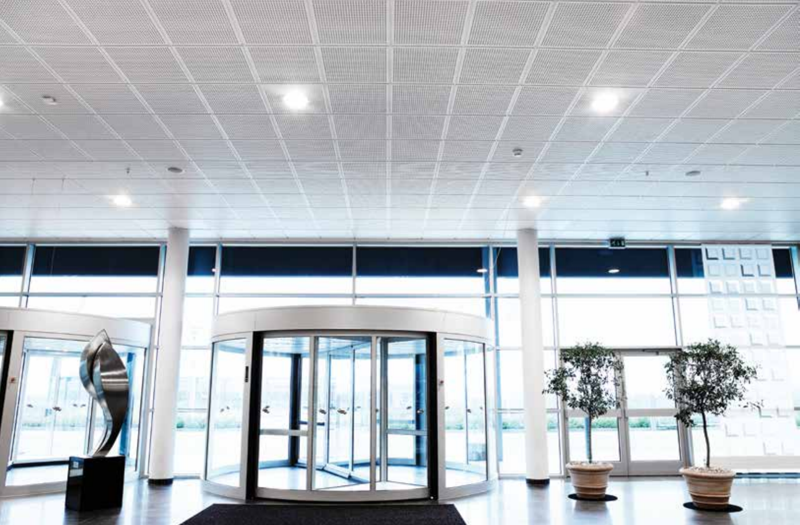
QUATTRO 20™ Narrow Reveal