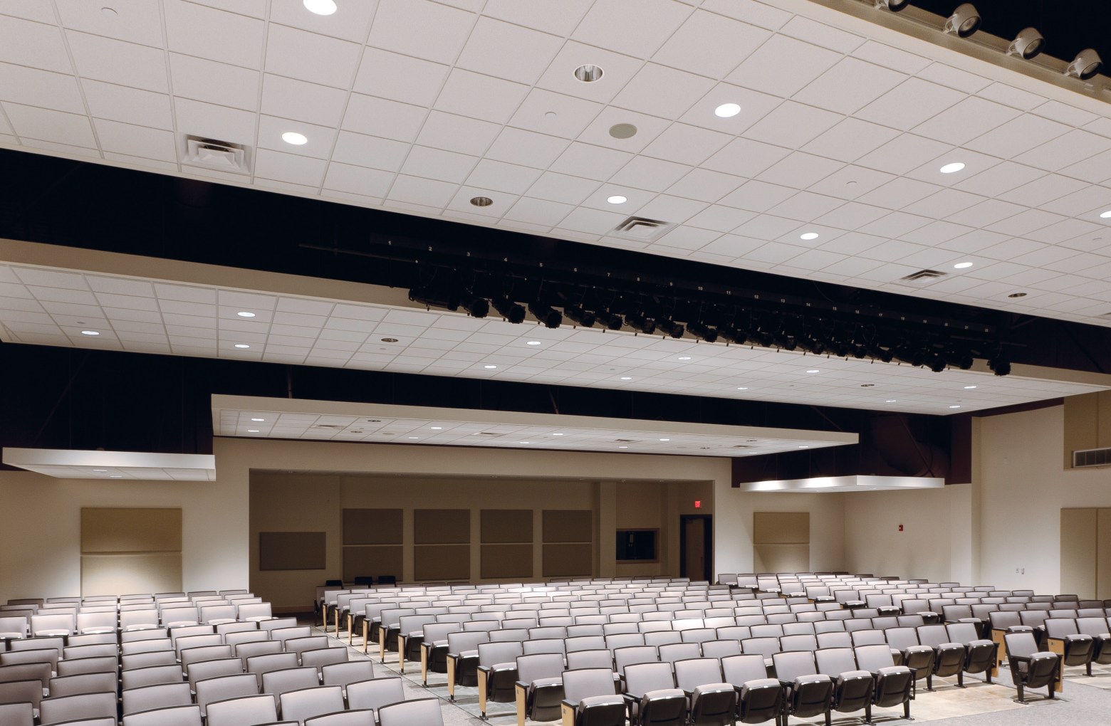
Fine Fissured Reveal (White) (HHF-154)