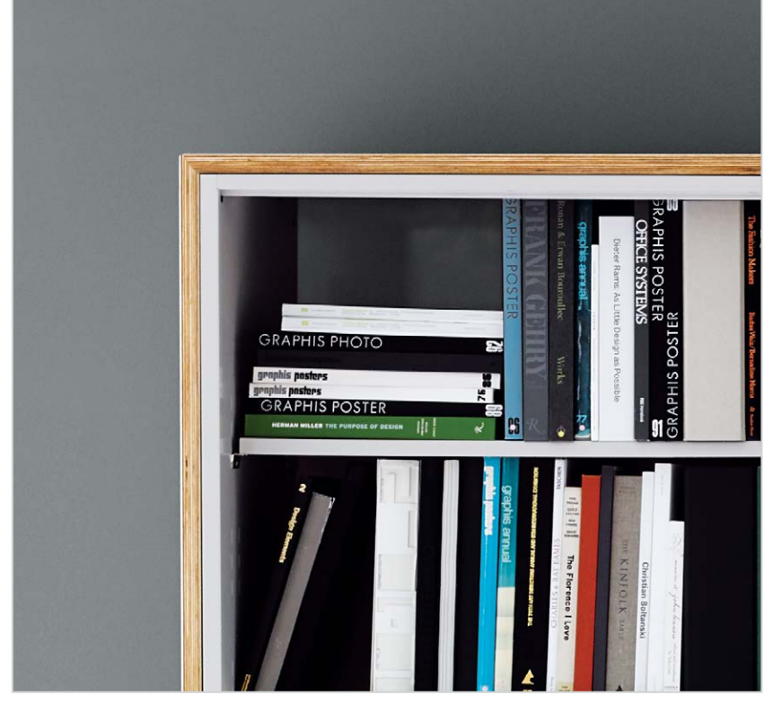
Veneer File Surround