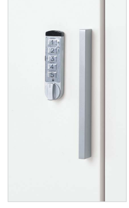
Combination Lock for Locker