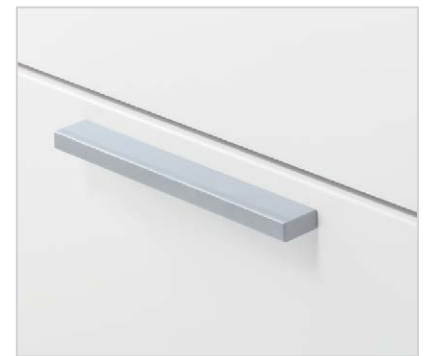
Bar Pull Arc Pull