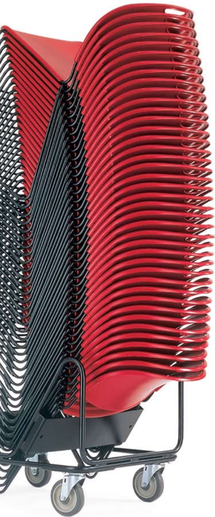
Red polypropylene with Black trim.