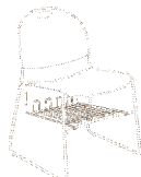
System 12 with bookrack