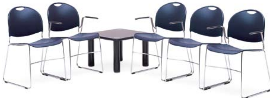
Navy polypropylene with Chrome trim.

Ganging Connector allows for attachment of any type, and any number of chairs in a linear format.