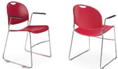
Red polypropylene with Chrome trim.

Ganging Connector allows for attachment of any type, and any number of chairs in a linear format.