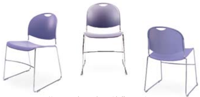
Neptune polypropylene with Chrome trim.

High volume seating should be a low stress proposition. Take System 12. It's smartly priced. Lightweight. Tough. Easy to maneuver. And it's stackable up to 69" (40 high). So, go ahead, turn up the volume. You can handle it.