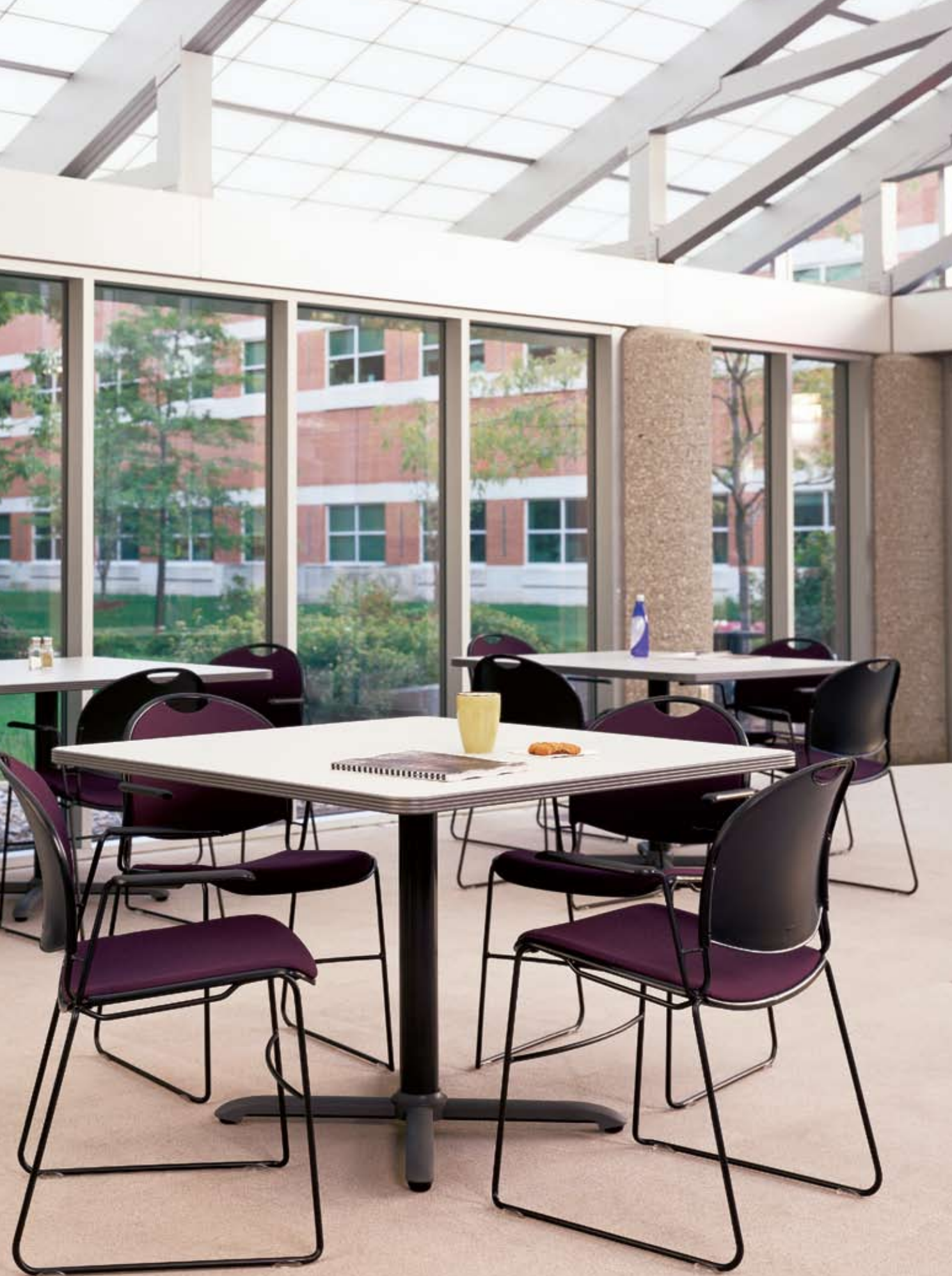
System 12 Seating: Tellure Plum with Black trim. Tactics Tables.