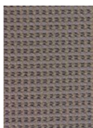
713 Hudson Grey