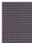
714 Grey Taupe