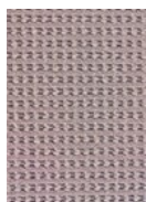
712 Grey Light