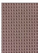
808 New Taupe