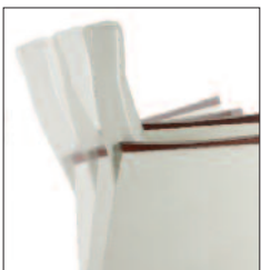
Smooth, stable rocking motion

Among the industry's most comprehensive healthcare lounge collections, the Affina Collection also includes lounge seating, guest seating, multiple seating, occasional tables, recliners, patient seating, and sleepover seating.