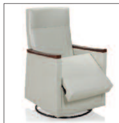
Field-replaceable arm caps, seat and back