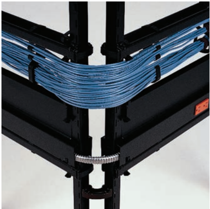
Cables run along corners and changes of height without the fuss of corner posts or barriers to feed through.

Inscape provides true lay-in cabling with adjustable cable managers secured within the panel. Faster and easier installation is valuable during company growth or change. Cables flow seamlessly from frame to frame with less labor and little to no downtime. Other manufacturers' solutions require feeding cable through apertures at corners and changes of height, which slows down installation and reconfiguration.