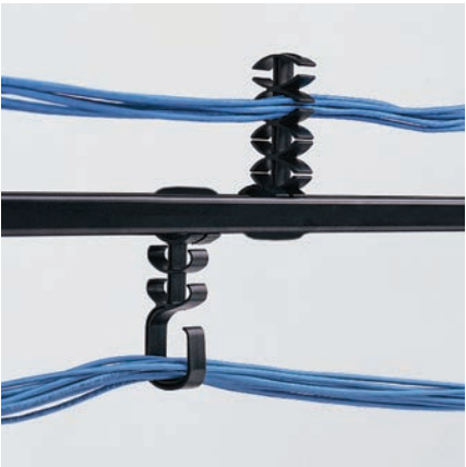
Cable hooks are pre-installed on frames to accommodate cable lay-in immediately.