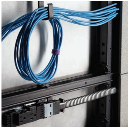
Lay-in technology, versus aperture-based systems, decrease install time - no need to thread cables through cut-outs in frames, saving time and manpower.

empower technology System accommodates large volumes of sensitive cabling without risk of damage or exposure to electromagnetic interference. Power is conveniently located wherever you need it, with flexible access.