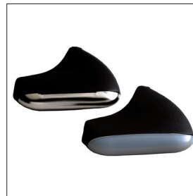
Glide options: steel, nylon, swivel steel, swivel nylon, or swivel felt.