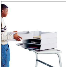
Optional book box is removable, stackable, and can be used as storage or keyboard tray (optional mouse tray also available).