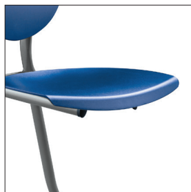
Waterfall seat edge reduces pressure points on legs.