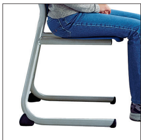
Cantilever base provides generous leg room.