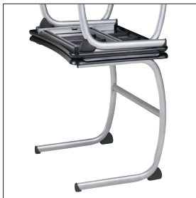
Desks stack four high.