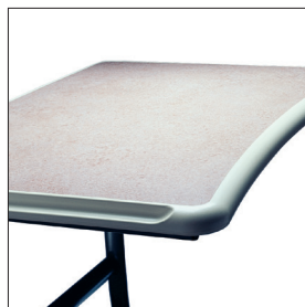
Comfort curve lets users get closer to the work area.