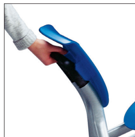
Built-in handle allows easy moving or lifting of chair.