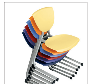
Chairs stack six high.