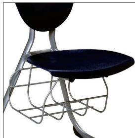
Chairs and double entry desks offer optional book baskets.