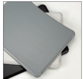
Durable tops have glue-in laminate inserts in 3 solid colors or a wide selection of other laminates.