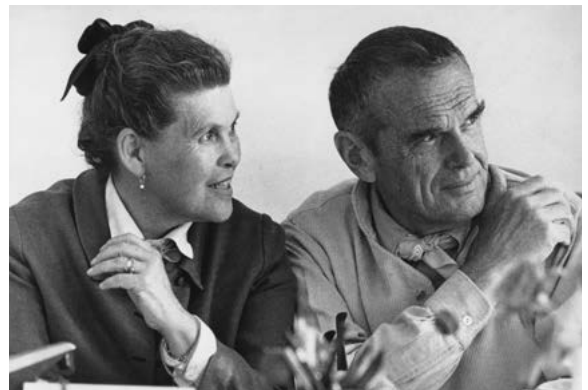
Ray and Charles Eames

The fertile, curious minds of Charles and Ray Eames invented the modern American furniture vocabulary. Along with other visionaries such as George Nelson, the Eameses brought new materials, new processes, and a new attitude to interior design. And they often did it by playing with form and structure in an inventive, childlike way. Their unique synergy led to a whole new look in furniture: lean and modern, playful and functional, sleek, sophisticated, and beautifully simple.