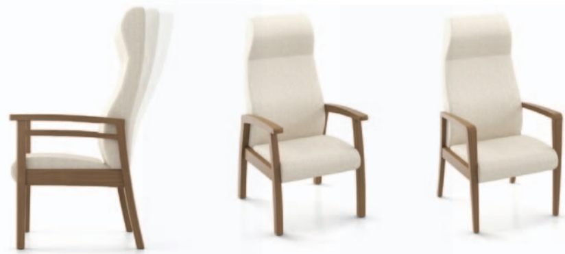
Bracebridge Highback Rocker 6501HR