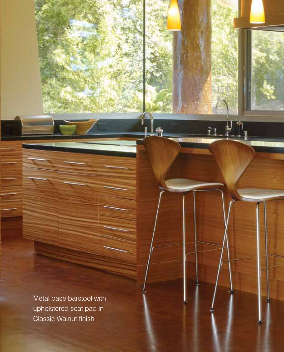
Metal base barstool with upholstered seat pad in Classic Walnut finish