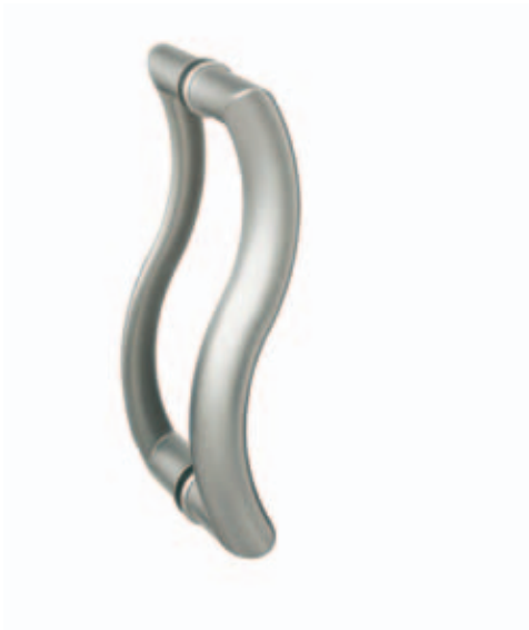
Illustration: right hand, outside view