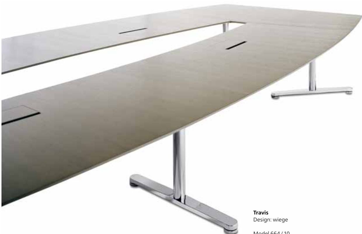
Travis Design: wiege

The modular frame is an articulating structure of columns, beams and tabletop bearers that can be flexibly positioned. Whether open-centred, closed, round, oval, barrel or boat-shaped, or square at any angle, Travis offers the right shape for virtually any room. – Even sizeable media equipment can be fitted into the frame. The tables have special cable channels, adapted to the lengths of the beams and linking angles. As a result, media technology, transformers and leads can be integrated into table systems, with ease of access, functionality and appearance maintained.