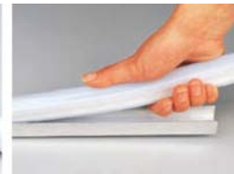
Linear installation Includes: Channel LN-FX-RGB-CH