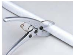
Cutting mark LN-FX-RGB Must be cut only on the indicated mark

When using RGB LED Neon-Flex outdoors, use portable lighting products. Basic safety precautions should always be followed to reduce the risk of fire, electric shock, and personal injury. Ground Fault Circuit Interrupter(GFCI) protection should be provided on the circuit or outlet to be used for LN-FX.