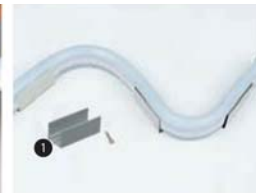
Curve installation Includes: 1. Mini channel LN-FX-RGB-5 2. Screw