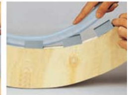
Concave installation Includes: Mini channel LN-FX-RGB-5