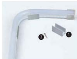
90 • Installation Includes: 1. Mini channel LN-FX-RGB-5 2. Screw