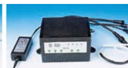
Low Voltage Power Supply Includes: 1. power plug 2. Transformer 3. AC/DC Converter