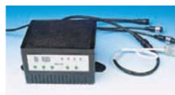
High Voltage Power Supply Includes: 1. power plug 2. AC/DC Converter