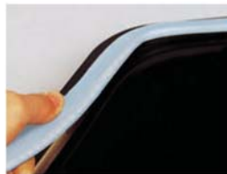
Installation with the slot Press RGB LEDNEON-FLEX into the slot of the installation