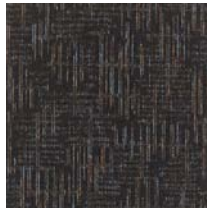
1315 Jackson Square