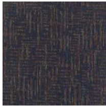
1311 Siam Square