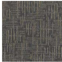
1313 Taylor Square