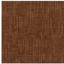
1308 Old Market Square