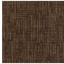
1307 Dam Square