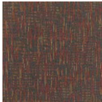
1314 Red Square