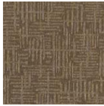
1305 Statue Square