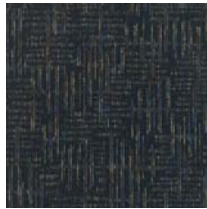
1312 Churchill Square