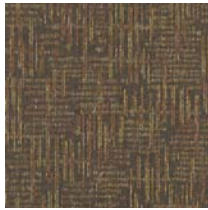
1304 Harvard Square