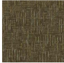
1310 Union Square