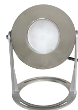
Small, no guard shown