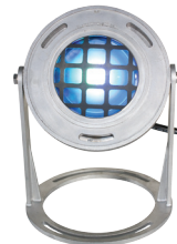
Small, with guard shown