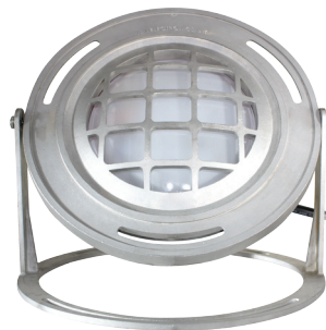
Large, with guard shown