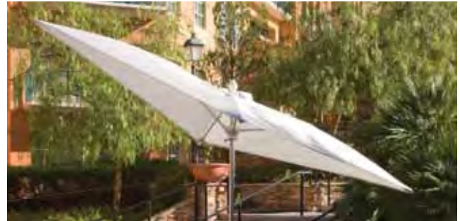
7NPU Nitro 7' 4 Rib Diamond Umbrella with Marine grade canopy, heavy duty one piece aluminum pole with push up and pin lift mechanism, NO TILT. (FiberBuilt)