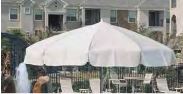
W900708 Garden 7½' 8 Rib Umbrella Silver Anodized Pole, with crank and tilt Fabric selections shown on pages 91-94.