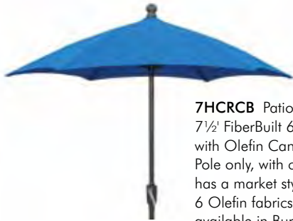
7HCRCB Patio 7½' FiberBuilt 6 Rib Hexagonal Umbrella with Olefin Canopy, Champagne Bronze Pole only, with crank, NO TILT. This Umbrella has a market style canopy and is available in 6 Olefin fabrics. See below for colors. Not available in Burgundy.