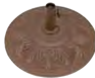
9750 - 50 lb. 9751 - 80 lb. Cast Aluminum Umbrella Base Available in Select Finishes only