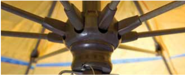
Detail Shown is of the hub, rib and finial for Lucaya and Market Umbrellas