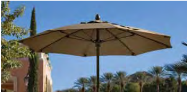
8LPU Lucaya 8' 8 Rib Octagonal Umbrella with Marine Grade Canopy, heavy duty one piece aluminum pole with push up pin lift mechanism, NO TILT (FiberBuilt)