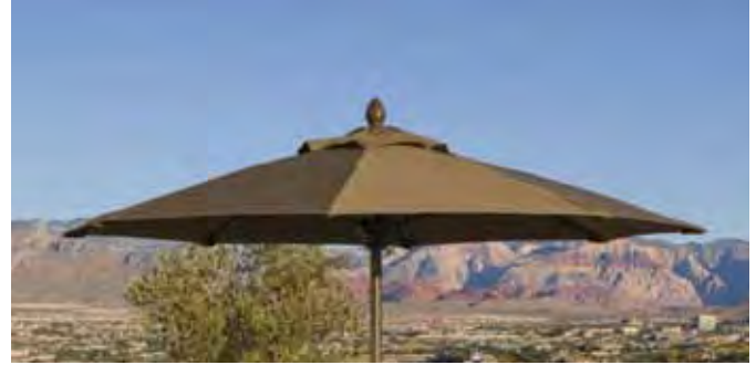
T9107MC Market 7½' FiberBuilt Umbrella, 8 rib, champagne pole with crank, NO TILT, Finish: Champagne Bronze-CB only Fabric selections shown on pages 91-94.