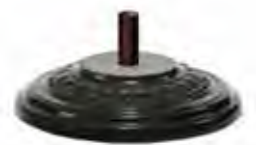
FB125 Freestanding Base Fiberglass Umbrella Base for freestanding applications. Available in Black, White, Green, and Sandstone. Ships empty with filling instructions. Must be filled with concrete. Fillable up to 125lbs.