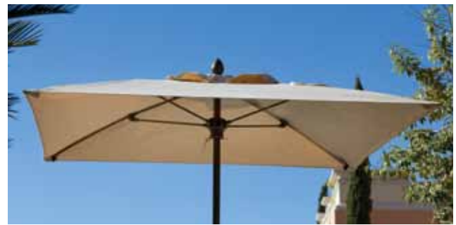
6SQLPU Quatro 6' 4 Rib Square Umbrella with Marine grade canopy, heavy duty one piece aluminum pole with push up and pin lift mechanism, NO TILT. (FiberBuilt)