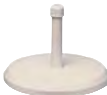
T9088 Polypropylene Umbrella Base Available in Black, White, Green, and Sandstone Prewighted to 88lbs.