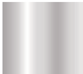
Bright Aluminum - A