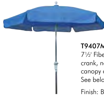
T9407MA Garden 7½' FiberBuilt 6 Rib Hexagonal Umbrella with crank, no tilt. This Umbrella has a valance style canopy and is available in a Textilene fabric. See below for colors.