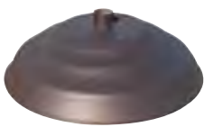
TC1050P Painted Aluminum Umbrella Base Available in all paint finishes. Bases should be filled with sand by end user for added weight.