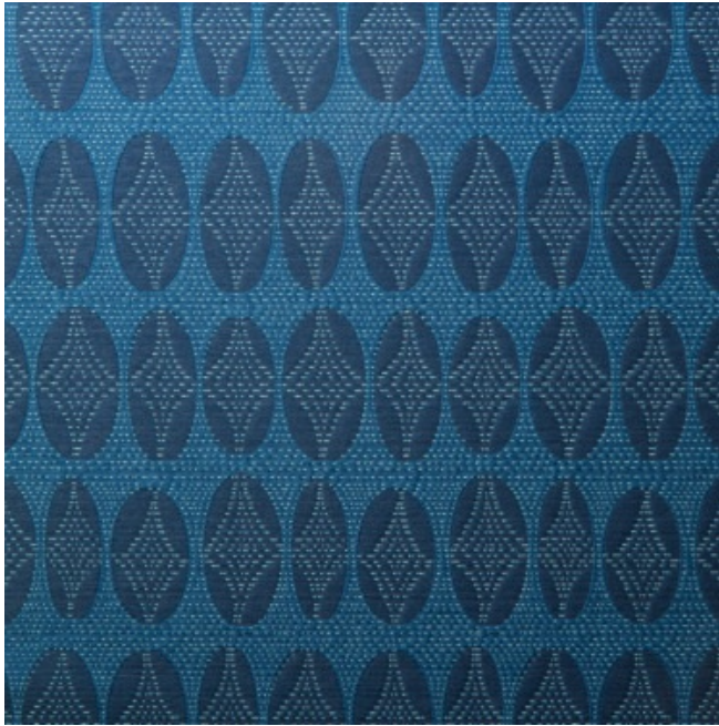
Image depicts 15 x 15 inch section