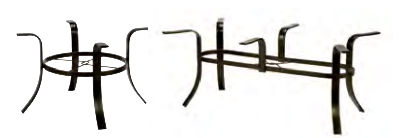
9354B 54" Round Dining Table Base Only for Tops EXT-054, CAS-054, RBM-054