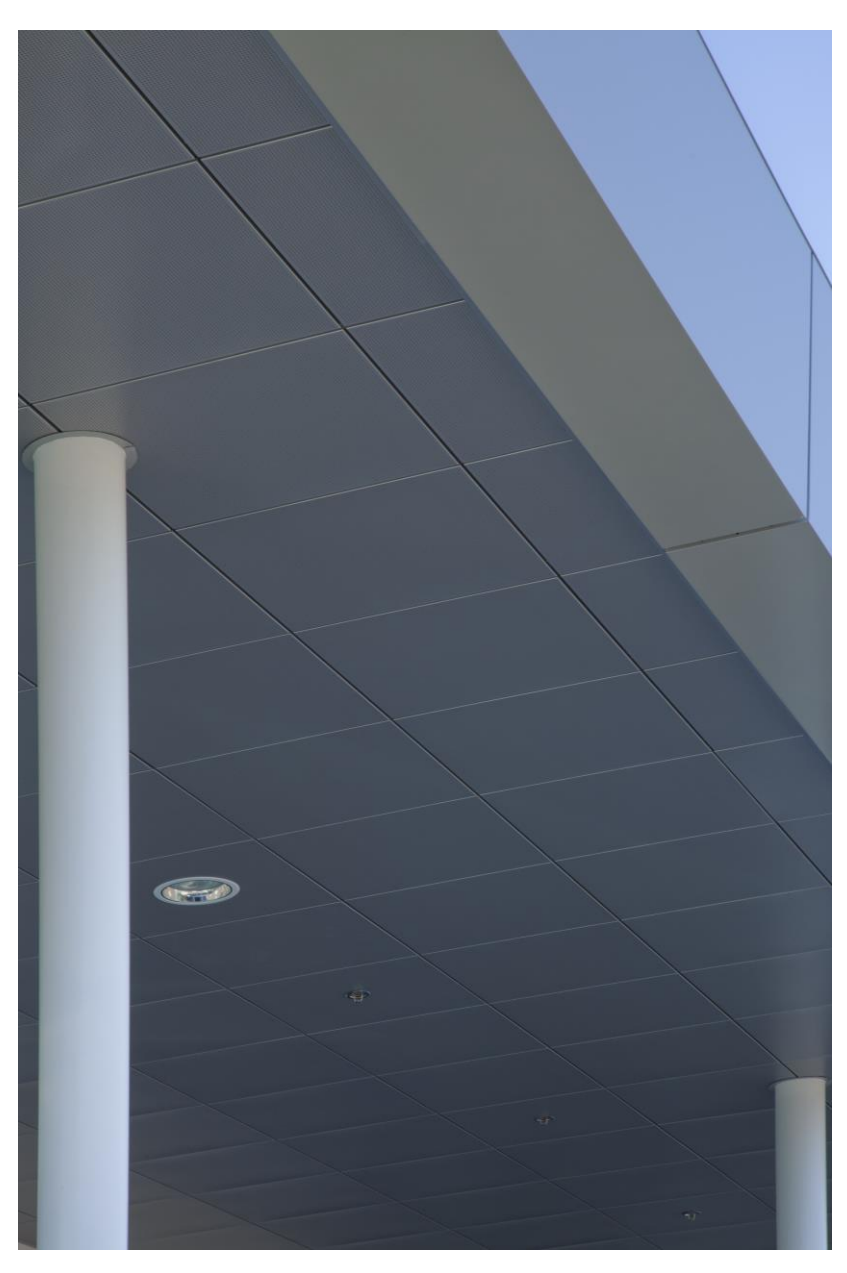
Steel specialty products include ceiling and wall systems, trims, column covers and associated suspension elements.