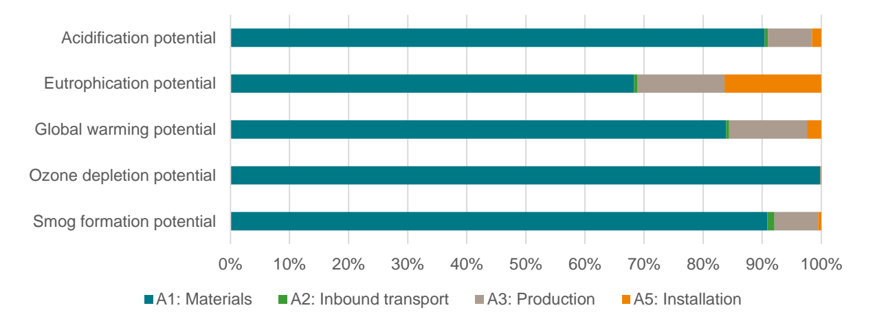
Figure 2: Life cycle impact assessment results for steel specialty product

Table 5: Life cycle impact assessment results per kilogram of steel specialty product