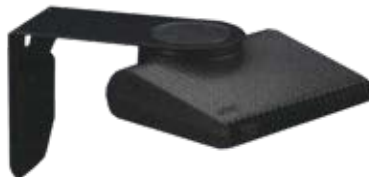
Wall or Panel Bracket 2020-E18-L-WPB