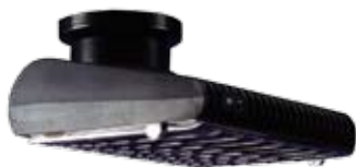
Magnetic Mount 2020-E18-L-MAG