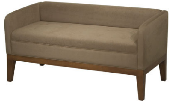
Symphony Lounge 4970 2-Seat Demi Back Settee

ERG designs our products so that they can be easily disassembled and separated for recycling or reuse at the end of a products useful life.