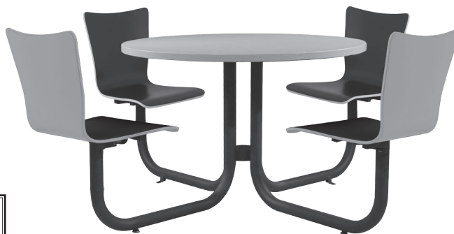
FOUR SEAT CLUSTER WITH 40" ROUND TABLE AND BENTON LPS WOOD SEATS

The Roundabout features a fully welded 2" round steel tube floor mount frame, laminate table top and your choice of swivel seats with auto return.