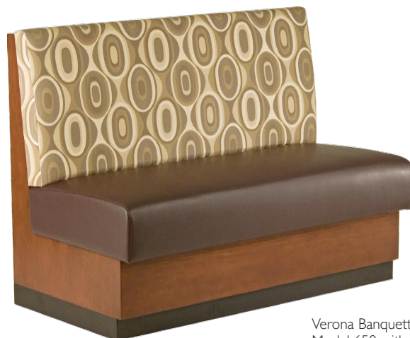
Verona Banquette Model 650 with Wood Veneer Frame

End of Life: Recycling & Reuse ERG designs our products so that they can be easily disassembled and separated for recycling or reuse at the end of a products useful life.